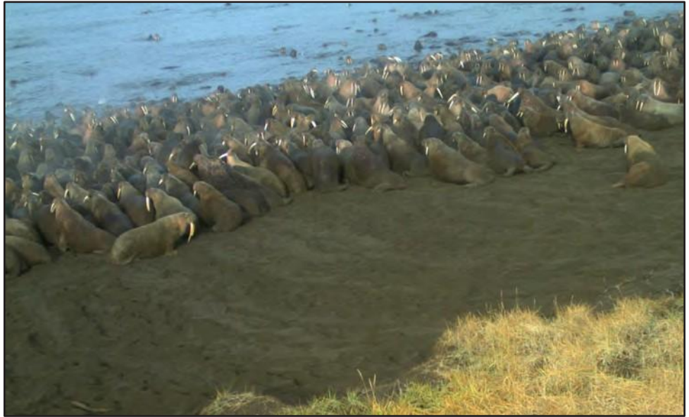
Pacific walrus fleeing a terrestrial haulout in response to human induced disturbance.

Marine mammals swimming or hauled out on land, rock or ice are sensitive to boats, and human presence. Noises, smells, and sights may elicit a flight reaction. Trampling deaths associated with haulout disturbance are among the largest known sources of natural mortality for walruses. Frequent or prolonged disturbances may even result in long-term haulout abandonment. Your vessel may not be the only one that day that has interacted with a particular group of walruses, please be aware that increasing levels of disturbance may