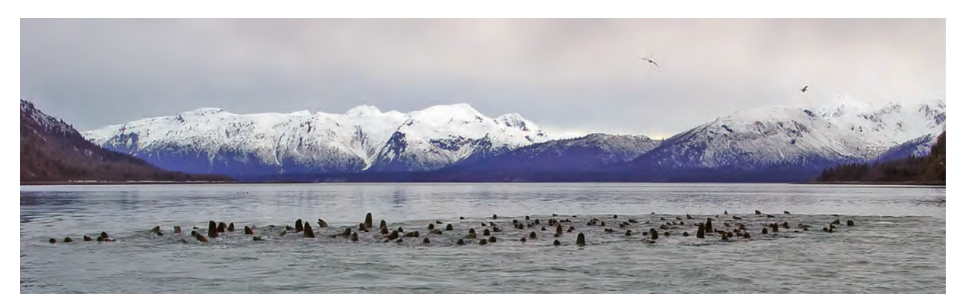
A group of sea lions in lower Adams Inlet, looking west.