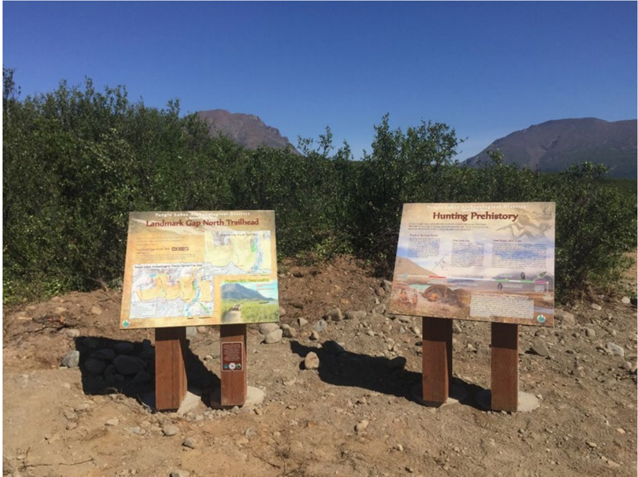
Figure 8. Picture of Landmark Gap-North trailhead kiosks after installation.