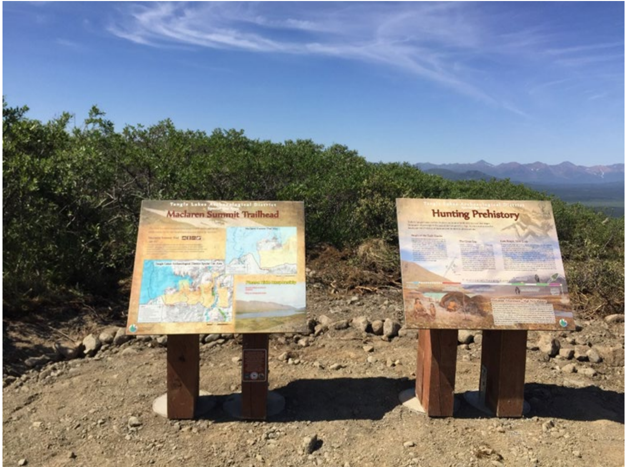
Figure 6. Picture of Maclaren Summit trailhead kiosks after installation.