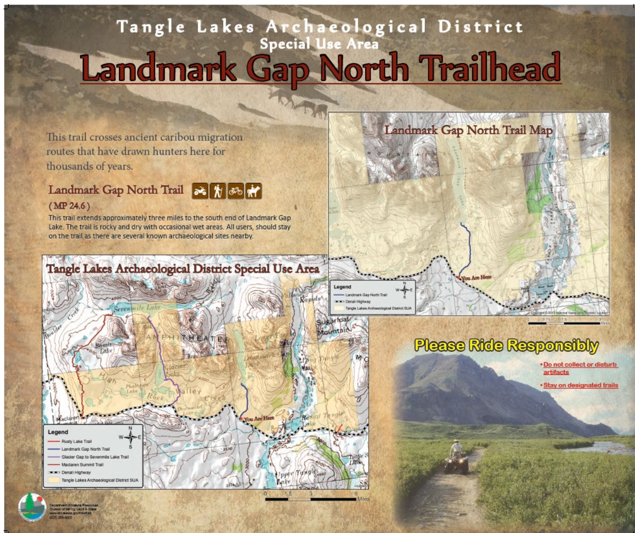
Figure 3. Close up of Landmark Gap trailhead interpretative panel design.