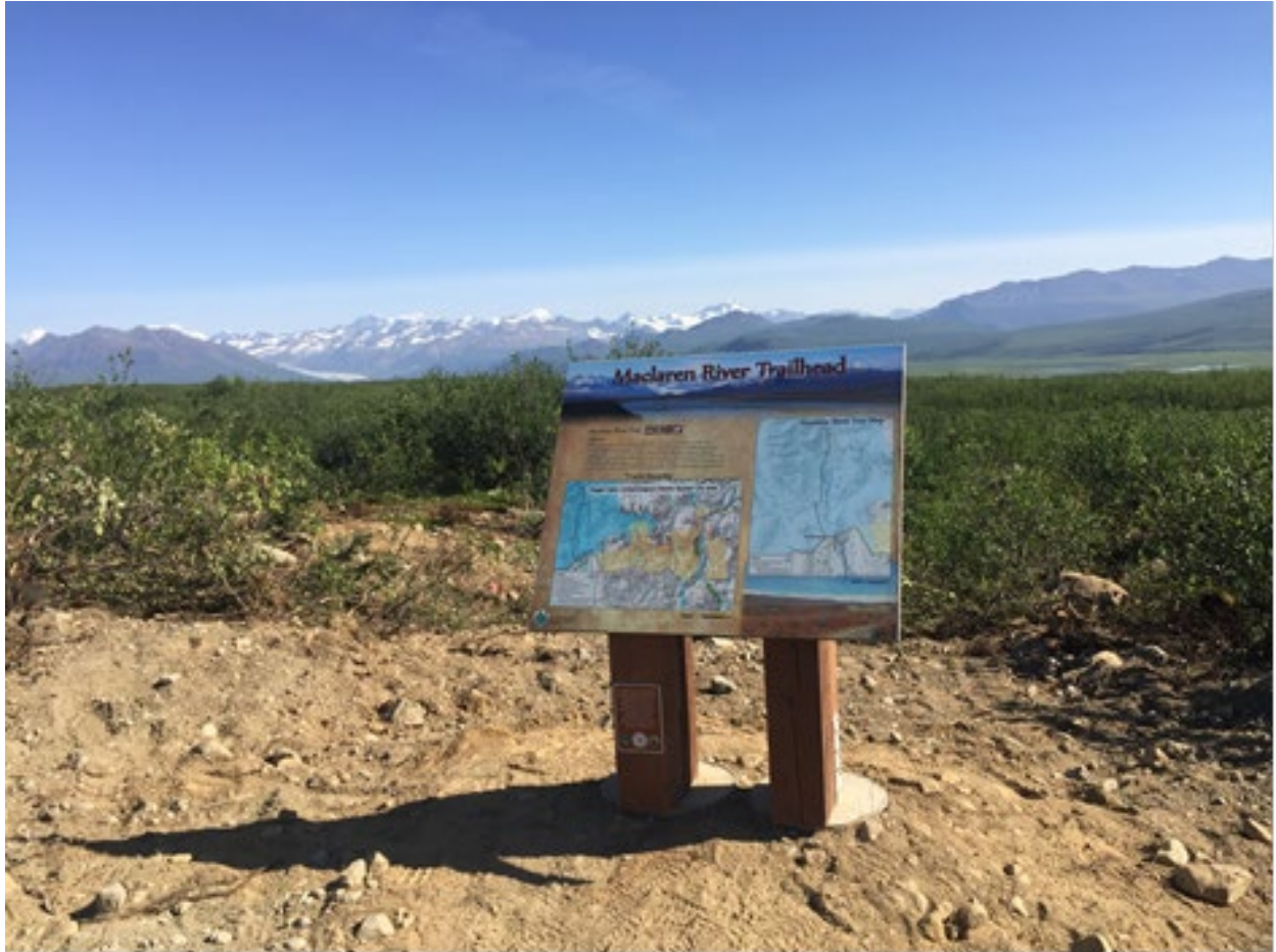
Figure 9. Picture of Maclaren River trailhead kiosk after installation.