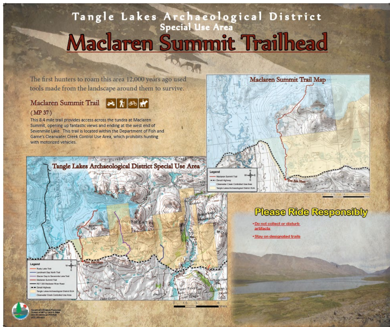
Figure 5. Close up of Maclaren Summit trailhead interpretative panel.