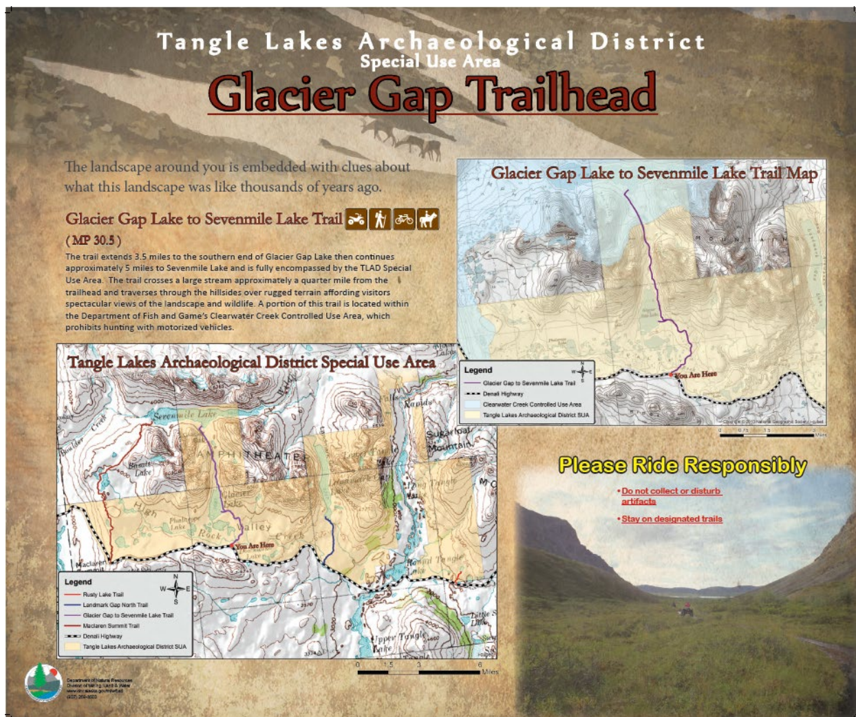
Figure 2. Close up of Glacier Gap trailhead interpretative panel design.