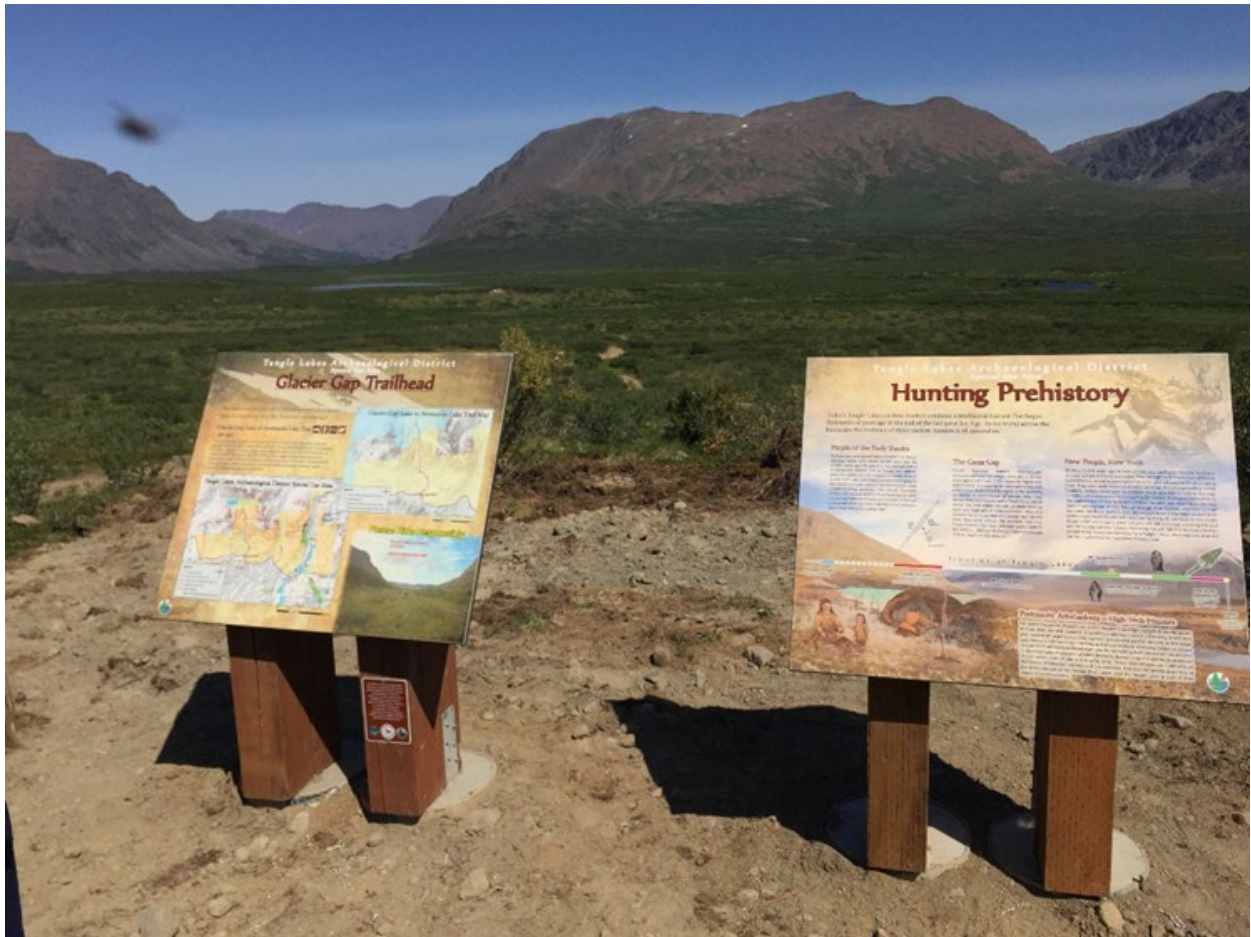
Figure 7. Picture of Glacier Gap trailhead kiosks after installation.