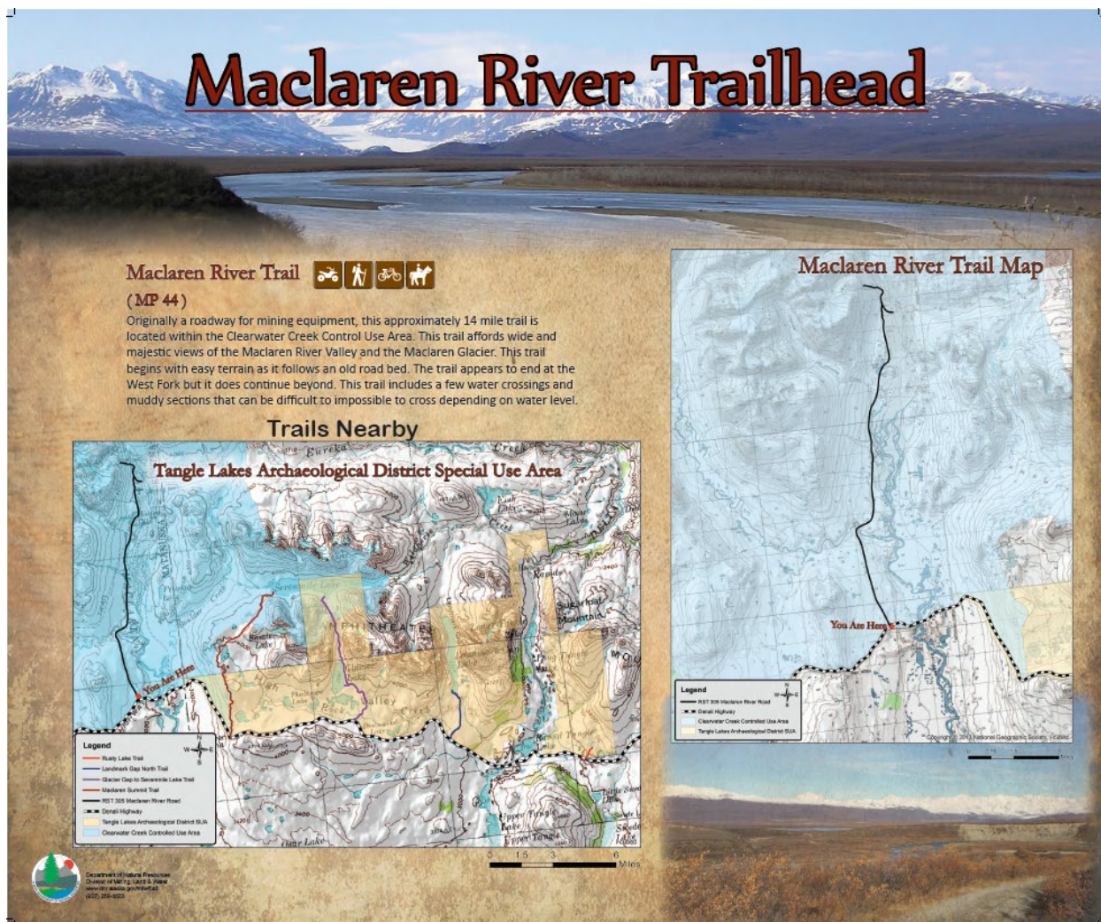
Figure 4. Close up of Maclaren River trailhead interpretative panel design.