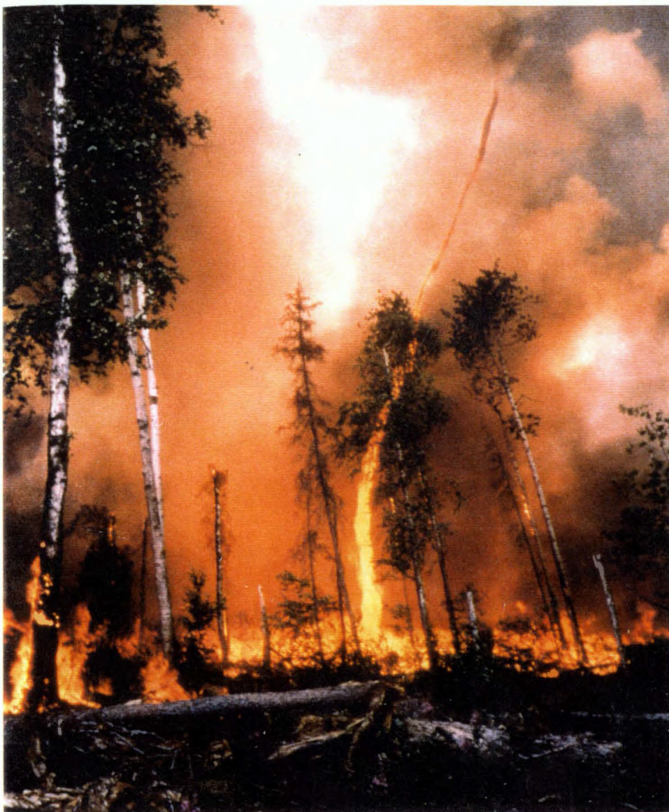
Alaska Dep of Natural Resources/Division of Forestry