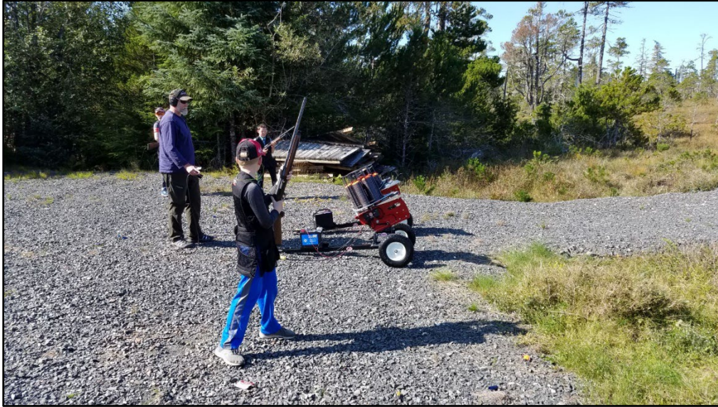
Youth Shotgun League participants using one of the new trap machines.