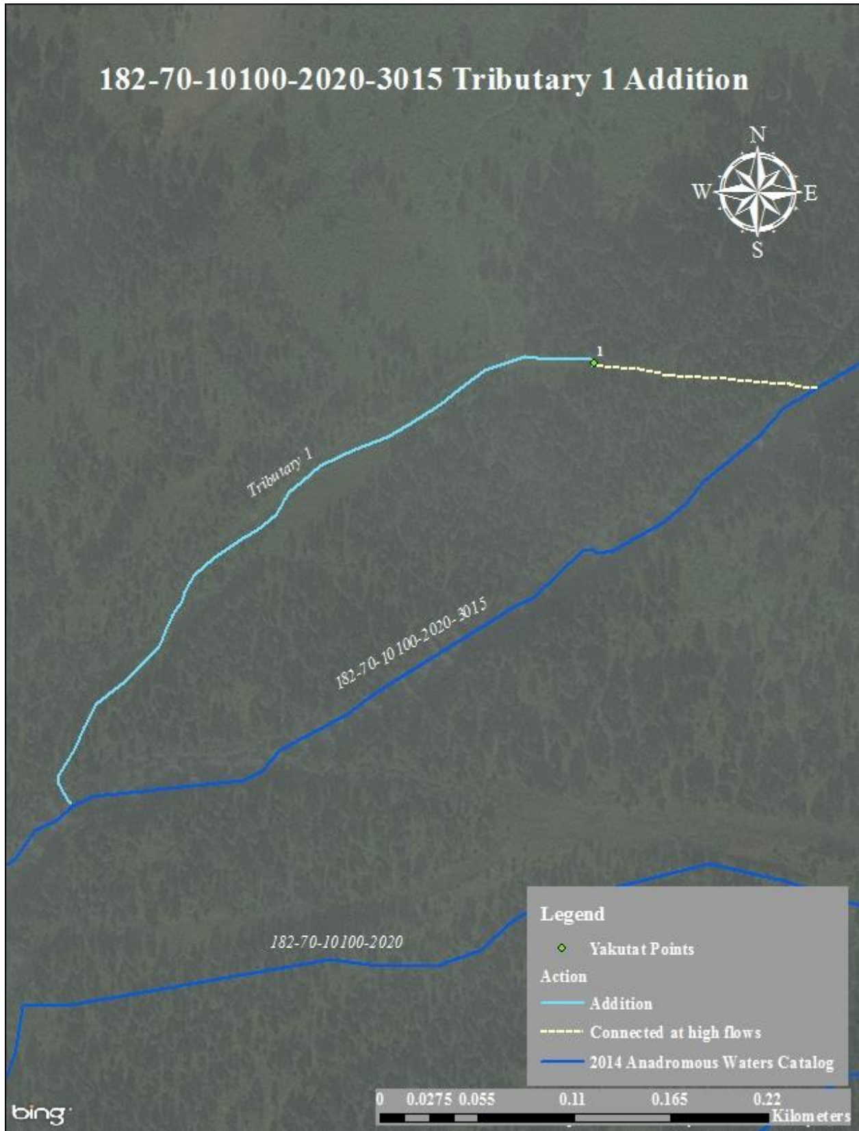
Figure 2.—182-70-10100-2020-3015-4011 addition map; labeled Tributary 1 on map.