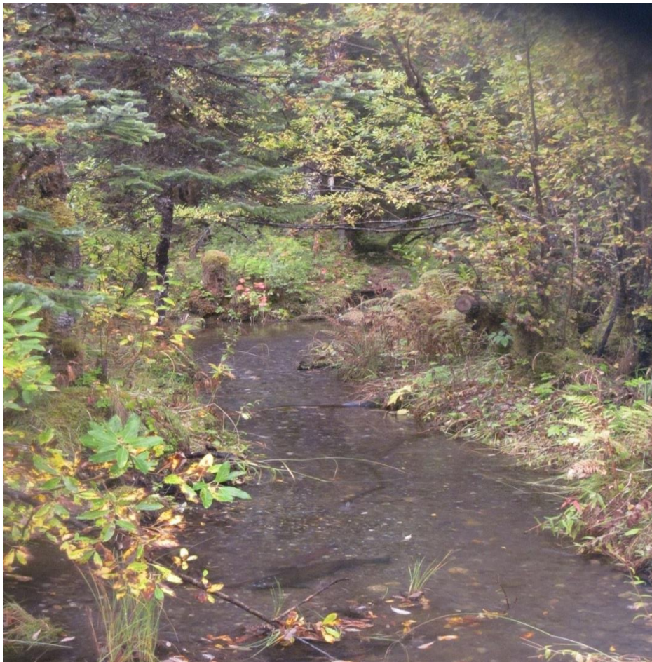
Figure 1.–Adult coho salmon spawning.