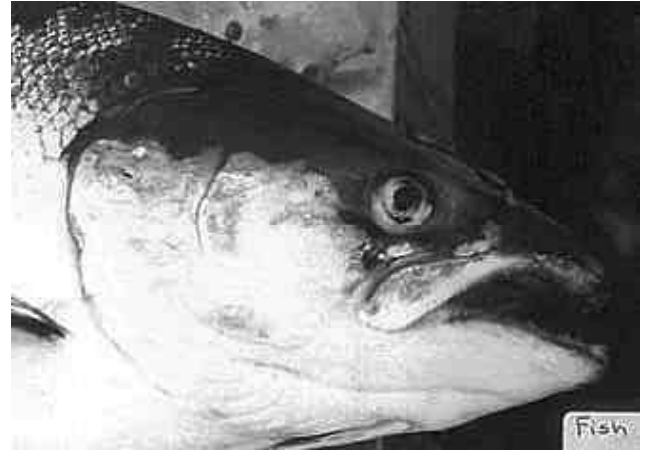
Figure 2: The range in occurrence of number of spots on the operculum of Atlantic salmon Salmo salar caught in Pacific Management Area 12 in 2000. The left photograph is a well-spotted Atlantic salmon from Queen Charlotte Sound, portraying typical coloration for this species. The right photograph is one of the 53 Atlantic salmon with no spots caught in Tribune Channel.