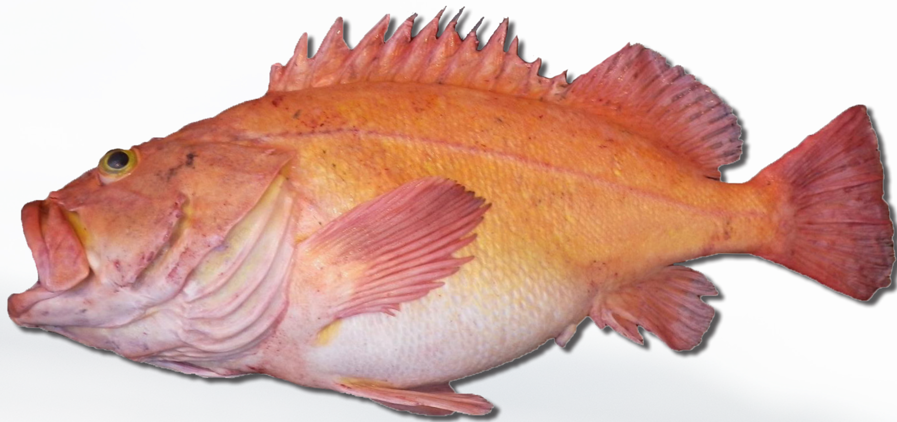
Yelloweye Rockfish ( Sebastes ruberrimus ) This fish is not the same fish that the otolith was extracted from.

The otolith pictured below shows that the fish, when harvested in 2021, was 121 years old. This fish was born at or around the year 1900, which was just five years after the yelloweye species was formally described.