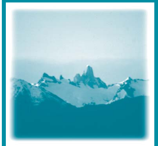
The "Devil's Thumb" at sunset—viewed from Mitkof Island, Southeast Alaska.

Most of the area lies within the Tongass National Forest boundary and is managed by the U.S. Forest Service. Remaining land is owned by state and local governments and the private sector. Kake Tribal Corporation owns the largest blocks of private land in the area.