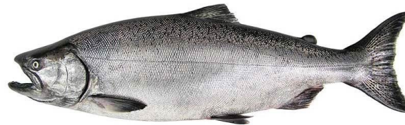
Chinook salmon