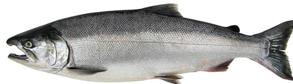
Coho salmon