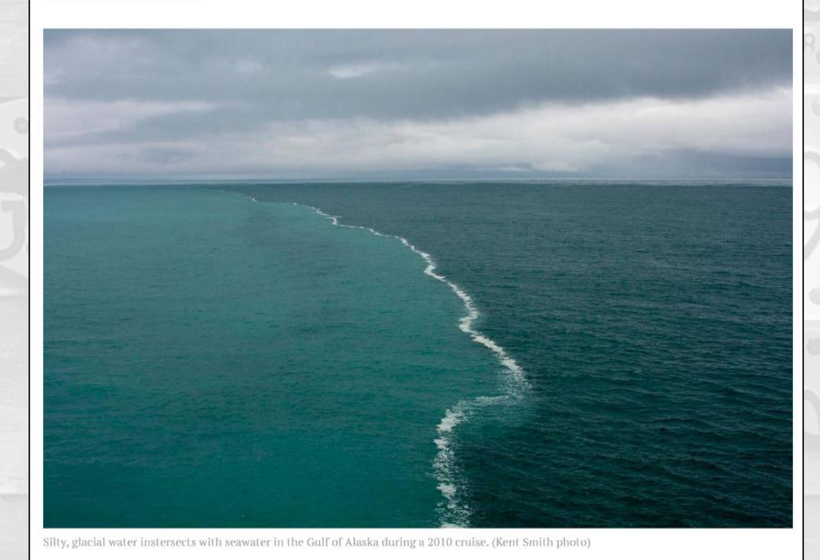
2017 ADN article on the Alaska blue economy.