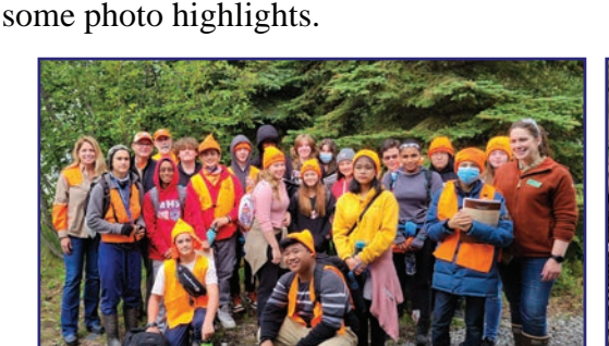
Anchorage School District Migrant Education hunter ed class