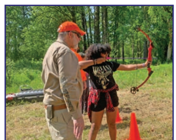
Getting kids excited about archery at Potter Marsh Discovery Day