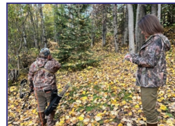
Anchorage bowhunter ed class