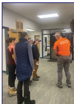
Fairbanks BOW hunter ed class