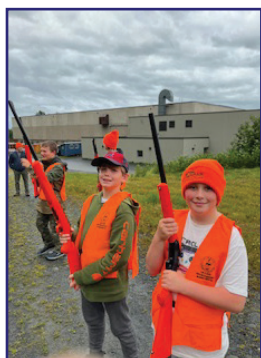
Valdez hunter ed class

Please keep taking photos in 2025 since we'll use your photos as we update the website, training PowerPoints, and class advertising materials.