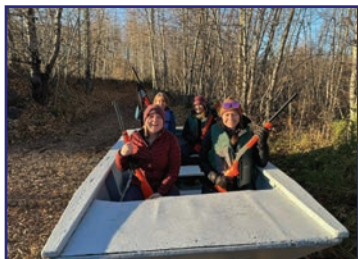
Anchorage BOW hunter ed class