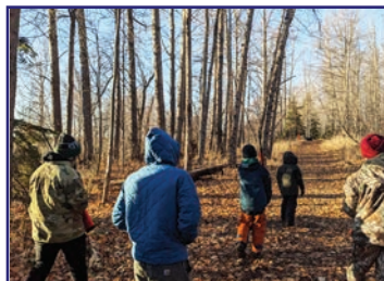
Anchorage hunter ed class