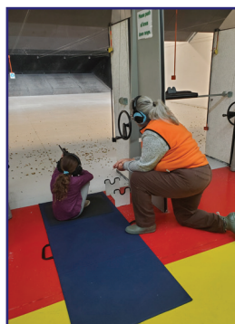
Juneau hunter ed class