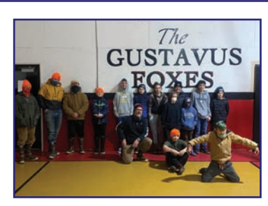
Gustavus hunter ed class

We're approaching the home stretch of not only 2020 but our certification course offerings for the year as well. While 2020 has been quite a doozy, it has just continued to reinforce how amazing our HIT Program volunteers are. So many of you stepped up in a huge way by instructing certification classes this year, and those not comfortable in social situations, communicated and reached out to HIT Program staff to let us know you're still there which is also greatly appreciated.