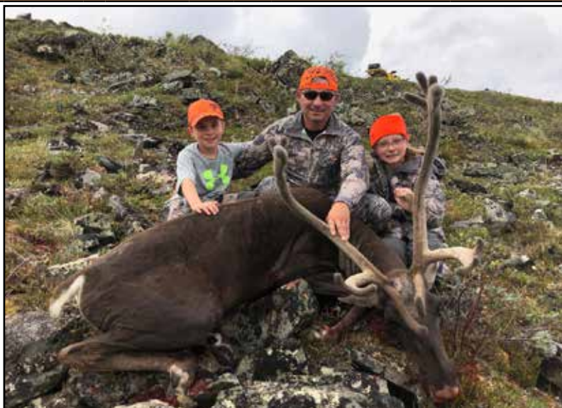
Louis Juergens family caribou hunt.

In Unit 23, snowmachines may be used to position caribou, wolf, and wolverine for harvest and they may be shot from a stationary snowmachine .