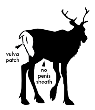
vulva patch, peeing backward = cow caribou