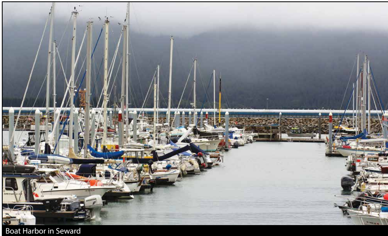
Boat Harbor in Seward