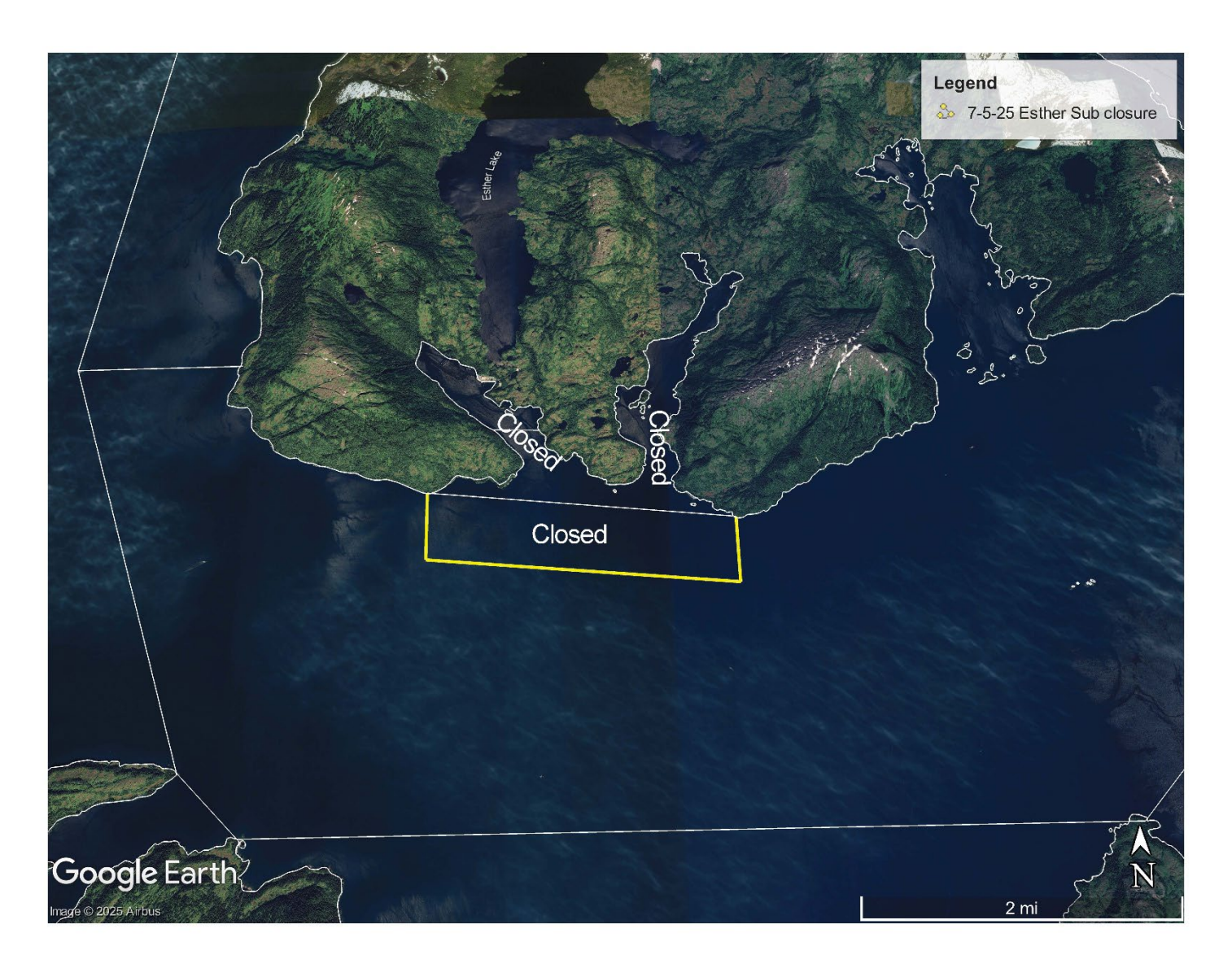
Figure 1.- Esther Subdistrict closure area.

The department also encourages permit holders to report observed violations to Wildlife Safeguard at 800-478-3377. Reports are anonymous and cash rewards may be paid for successful prosecution of violations.