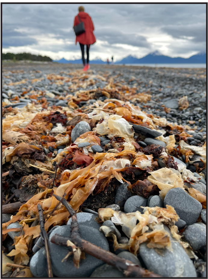
Resources for Harvesting Seaweeds for Food and Gardening

For those that are interested in harvesting seaweeds for food, there are many great resources for learning more about how to identify harvestable seaweed