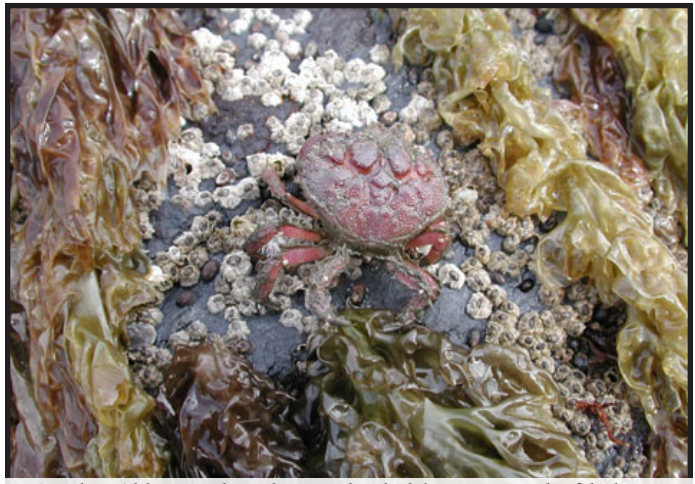
Porphya Abbottae

For Cook Inlet and North Gulf Coast aquatic plant subsistence areas, the daily bag and possession limits of aquatic plants are limited to 10 gallons per person and there is no annual limit. In Prince William Sound, Kodiak, and Bristol Bay there are no bag and possession limits for aquatic plants. Alaska residents may harvest aquatic plants attached or detached from substrate. Best practices need to be taken into consideration when harvesting aquatic plants that are attached, including cutting or thinning the seaweed and not harvesting the entire plant. Also consider collecting your seaweed harvest from several locations instead of gathering it all in one area.