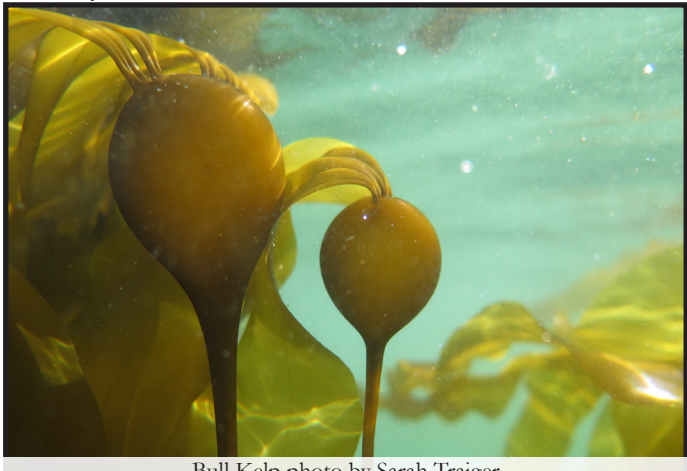
Bull Kelp

The stipe (the long stem-like portion) of bull kelp has been used to make rope and fishing line. The bulb portion of kelp has been used to store food. Seaweeds have also been consumed worldwide as a nutritious food source rich in minerals, vitamins, carbohydrates, and even proteins. Seaweeds have also been used in pharmaceuticals, to make gun powder, as garden fertilizer, and as a gelling agent in foods. In Alaska, wild seaweeds have supported commercial harvest and seaweed mariculture is a growing industry.