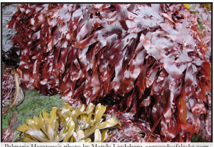
Palmaria Hecatensis

For Cook Inlet and North Gulf Coast aquatic plant subsistence areas, the daily bag and possession limits of aquatic plants are limited to 10 gallons per person and there is no annual limit. In Prince William Sound, Kodiak, and Bristol Bay there are no bag and possession limits for aquatic plants. Alaska residents may harvest aquatic plants attached or detached from substrate. Best practices need to be taken into consideration when harvesting aquatic plants that are attached, including cutting or thinning the seaweed and not harvesting the entire plant. Also consider collecting your seaweed harvest from several locations instead of gathering it all in one area.