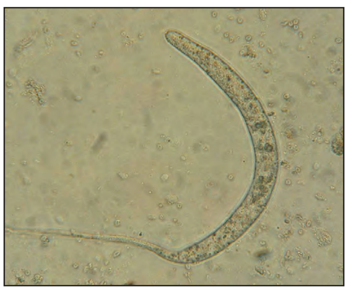
Juvenile Philonema nematode with posterior tail tapering into a fine point, X 400.