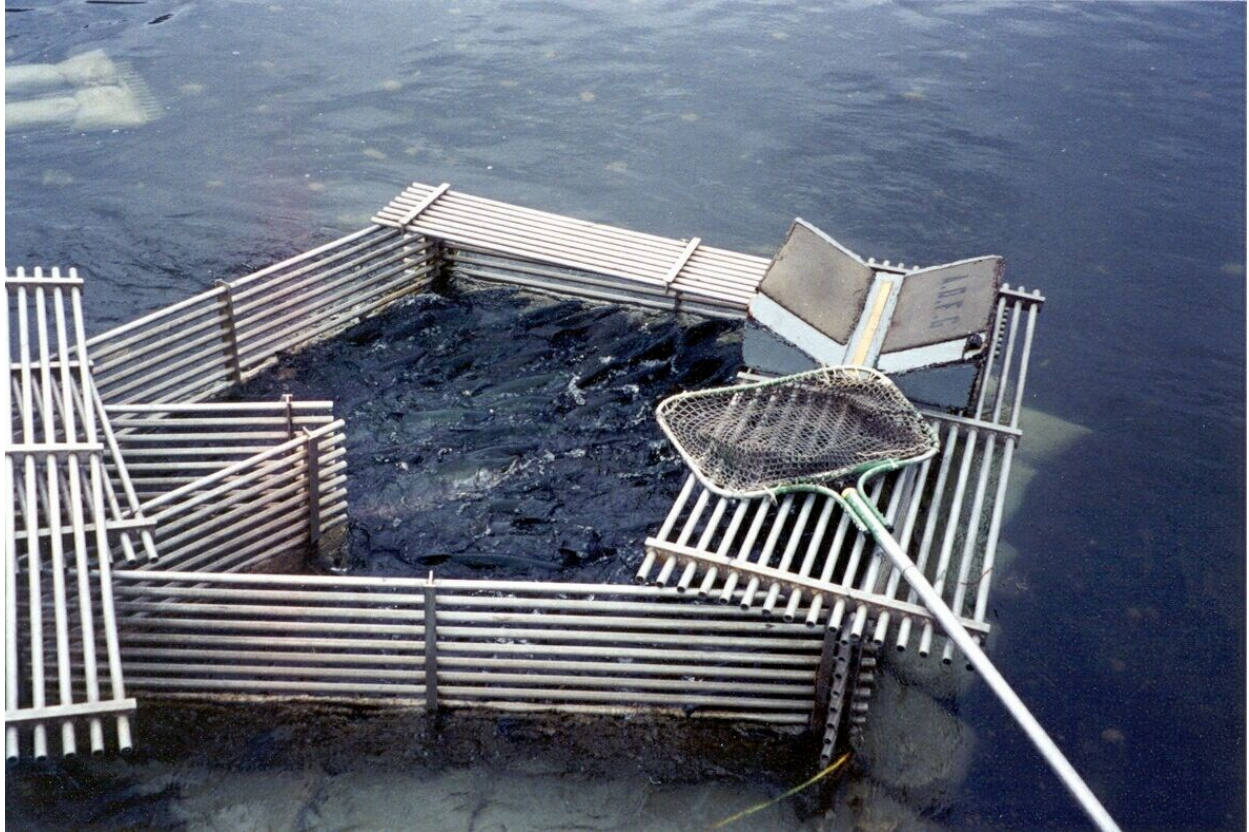
Figure 3.—Picture of weir trap setup.