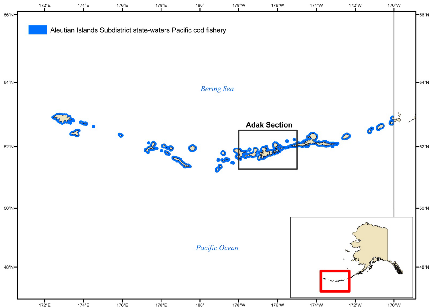
Figure 1.—Aleutian Islands Subdistrict state-waters Pacific cod management area.