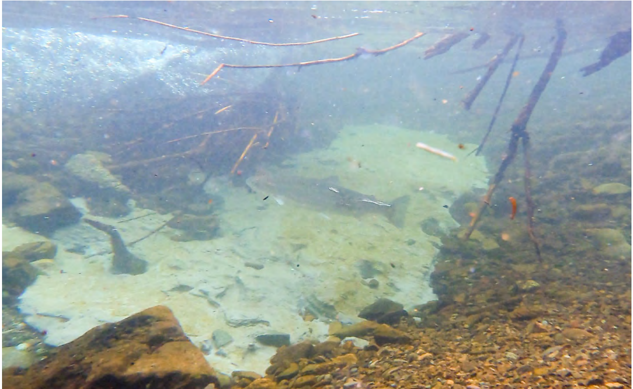
Figure 1.- Adult Steelhead captured on video under downed tree at waypoint 2.