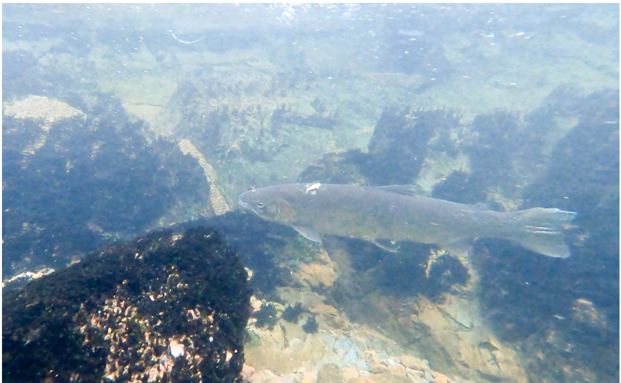
Figure 2.- Adult Steelhead hooked and lost at waypoint 3, captured on video after it resettled slightly downstream.