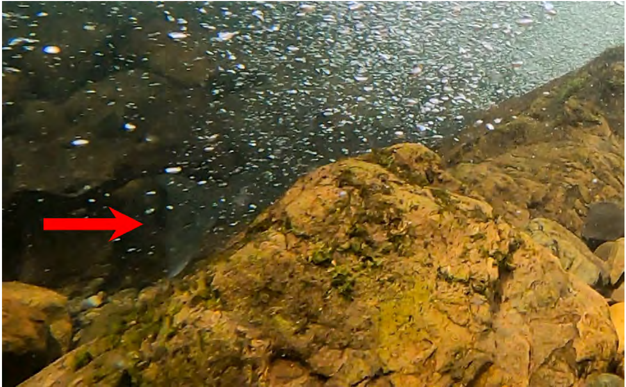
Figure 5.- Close-up of the photo in Fig.4, with red arrow pointing at caudal fin.