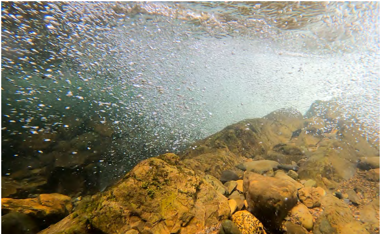
Figure 4.- Adult Steelhead hooked and lost at waypoint 5, captured on video after it resettled in its lie. The back half of the fish is visible in the lower left quadrant of the photo.