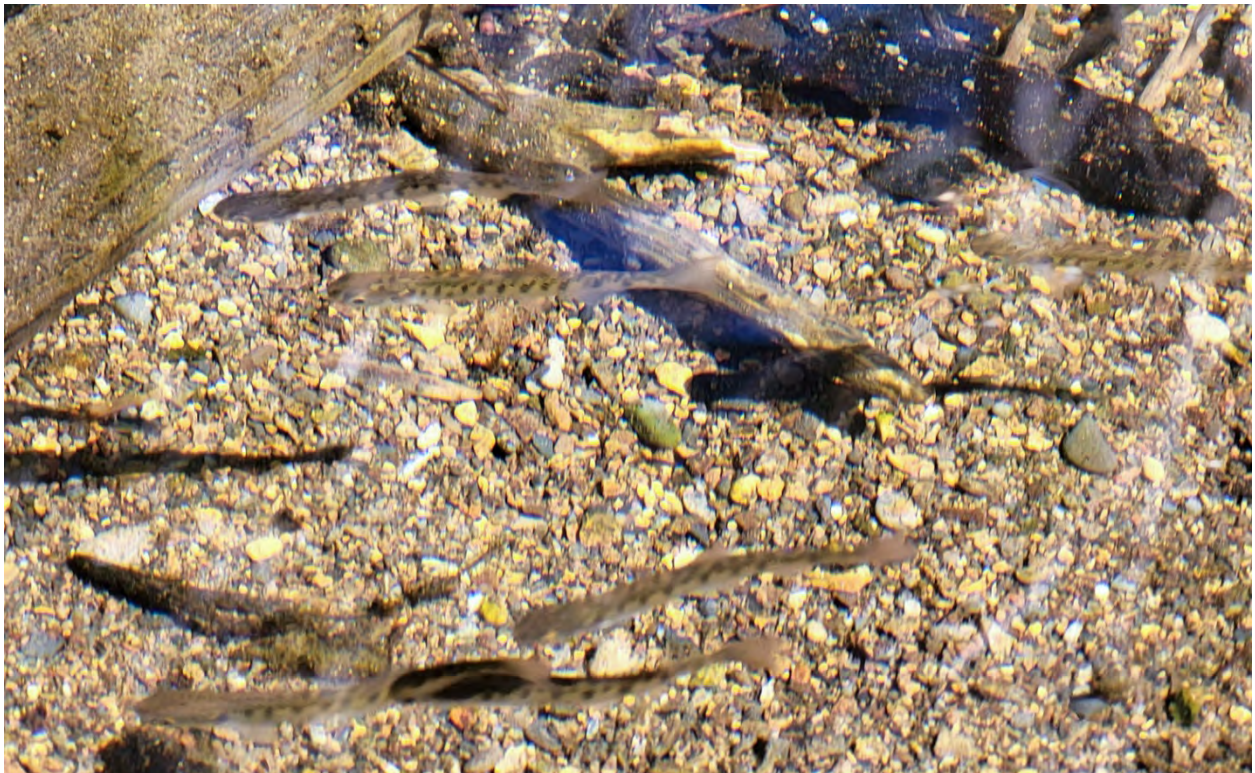
Figure 6.- Coho fry observed at waypoint 6.