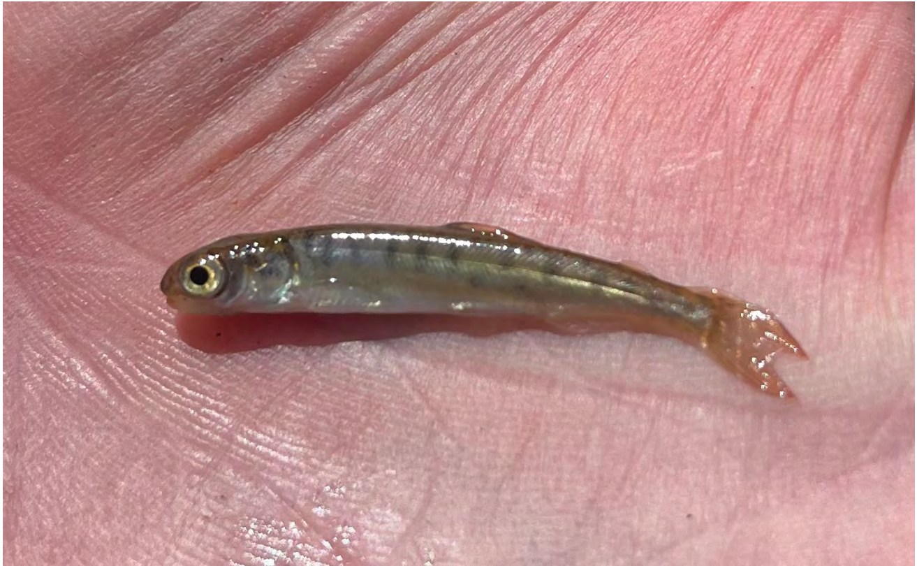
Figure 7.- Close-up of coho fry hand-captured at waypoint 6. Distinguishing characteristics (orange coloration of caudal fin, parr markings through lateral line, dark first ray of anal / dorsal fin) are just starting to develop in this fish.