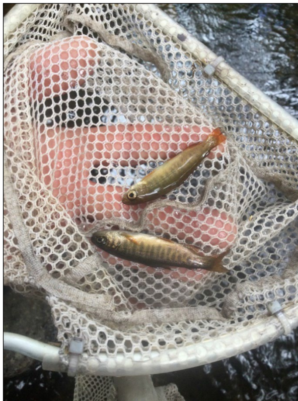
Figure 1.—Juvenile coho salmon captured at waypoint 1954.