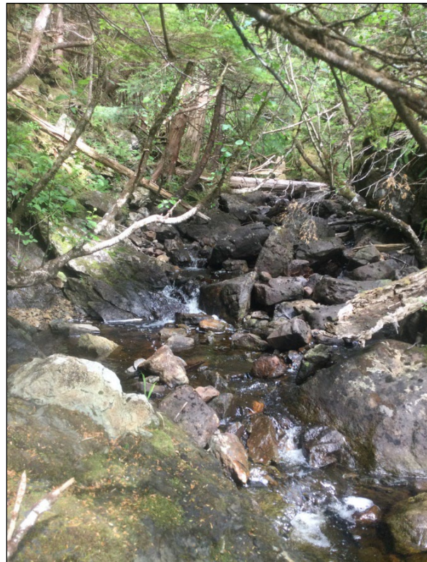
Figure 2.—Upstream view from waypoint 1954.