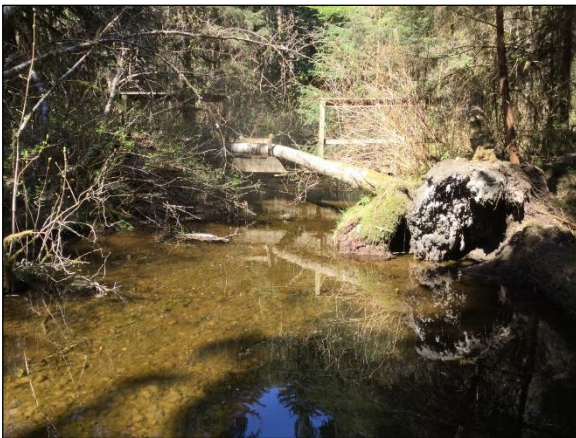
Figure 2.–Stream No. 111-50-10070-2005 at waypoint 311.