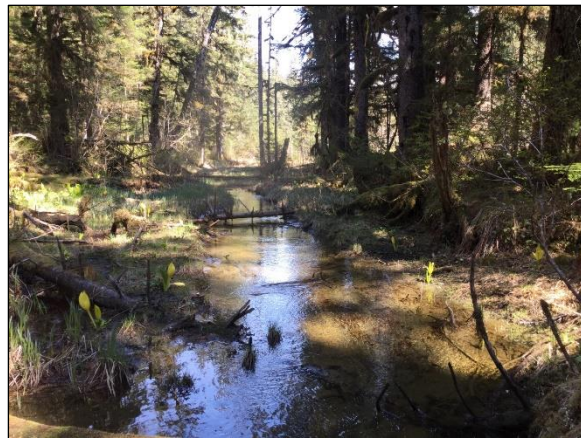
Figure 3.– Stream No. 111-50-10070-2005 at waypoint 1936