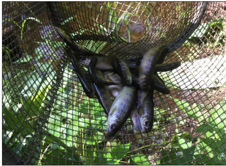
Figure 1.–Juvenile coho salmon captured at waypoint 1939.