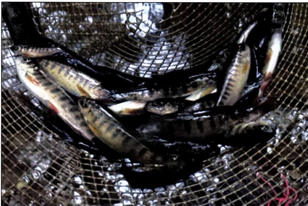
Figure 3. Juvenile coho salmon, cutthroat trout, and Dolly Varden captured at waypoint 541.