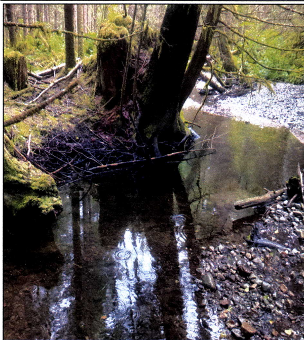
Figure 1. Upstream at waypoint 541.