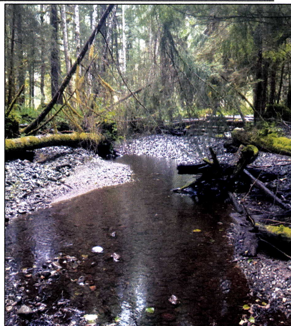
Figure 2. Downstream at waypoint 541.