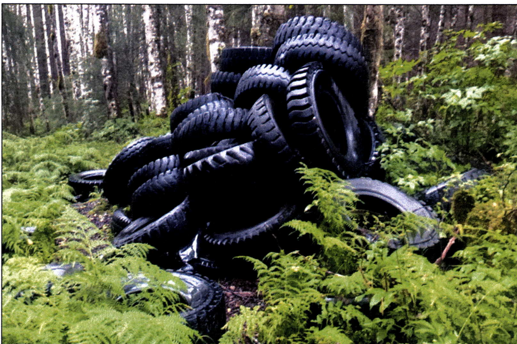
Figure 4. Tire pile at waypoint 543.