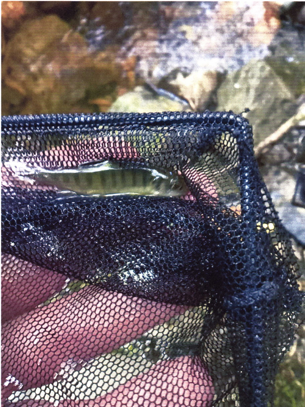
Figure 3. Photo of CO juv Trap#3 the most upstream Fish Observation Pt.

AWC Nomination Supplement Lake Ellen No3 tributary (AWC Cod 102-60-10950-0010-xxxx) on 6/21/2023.