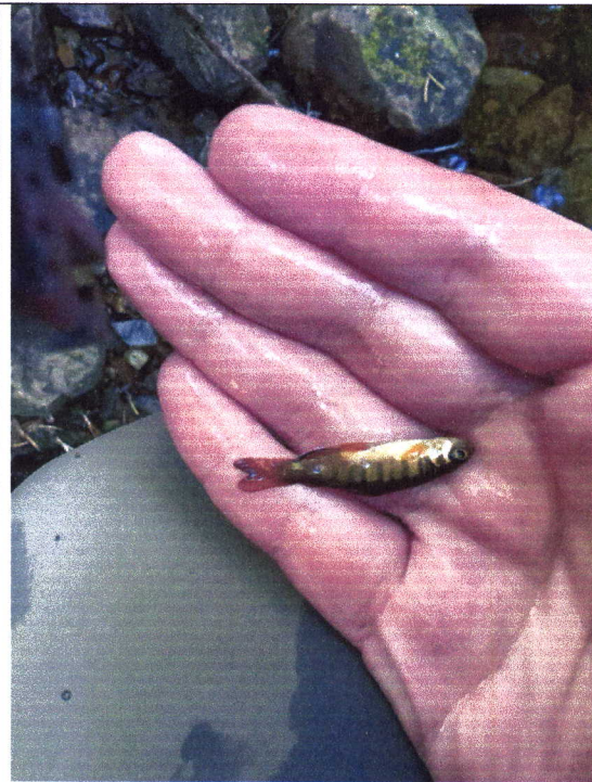
Figure 4. Photo of CO juv Trap #3.