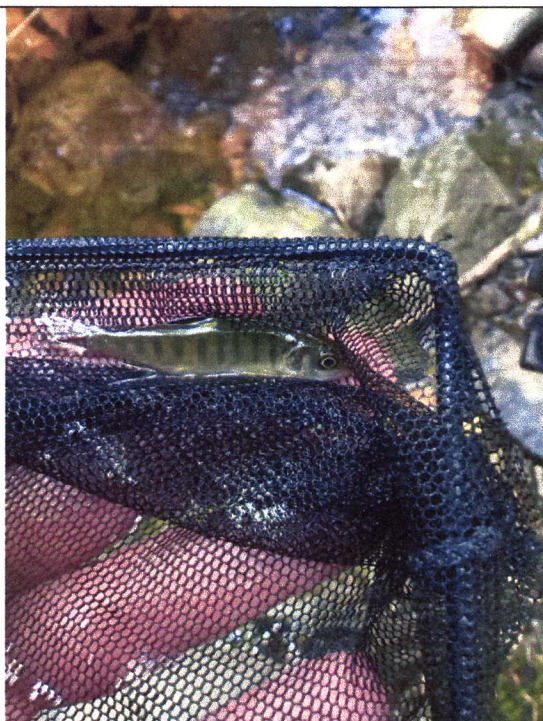
Figure 7. Photo of CO juv Trap #3.