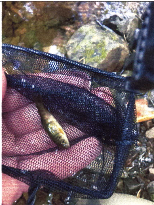
Figure 5 Photo of CO juv Trap #3.