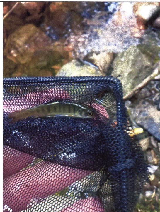
Figure 6. Photo of CO juv Trap #3.