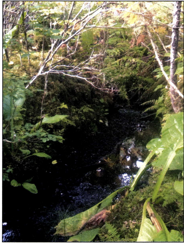
Figure 2.—Channel at waypoint 1740.