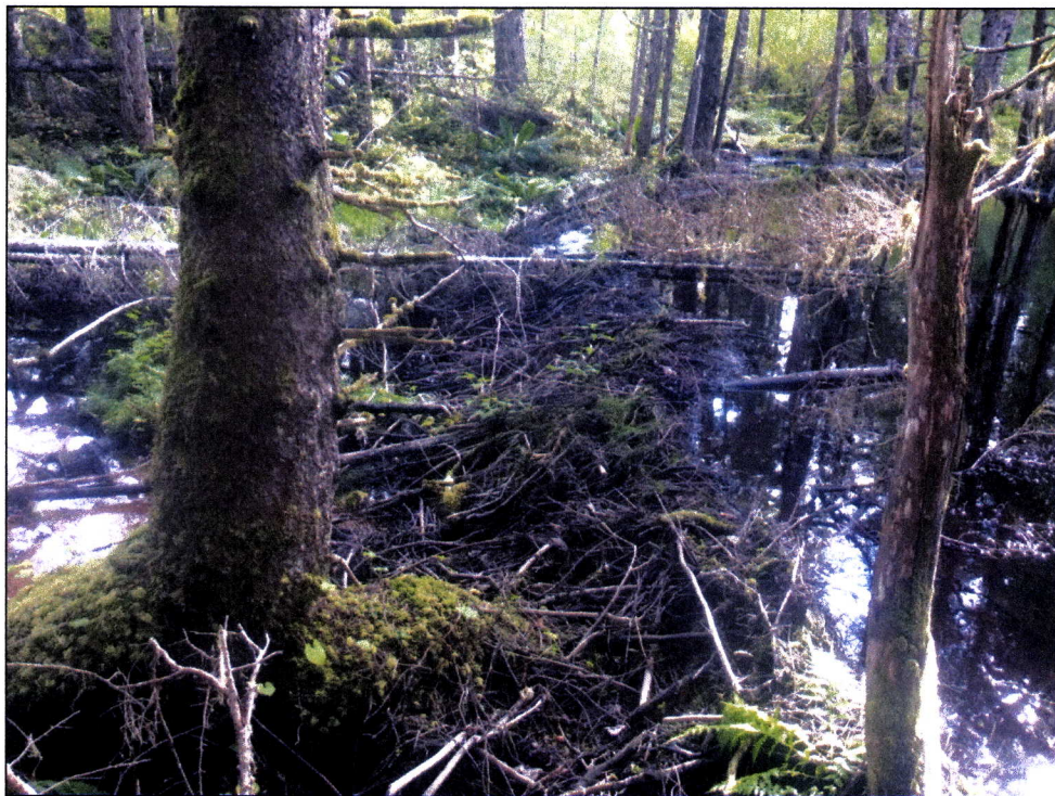
Figure 3.—Beaver dam at waypoint 1738.