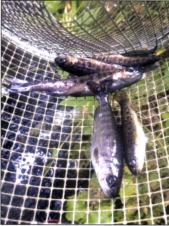
Figure 1.—Juvenile coho salmon and cutthroat trout captured at waypoint 1740.