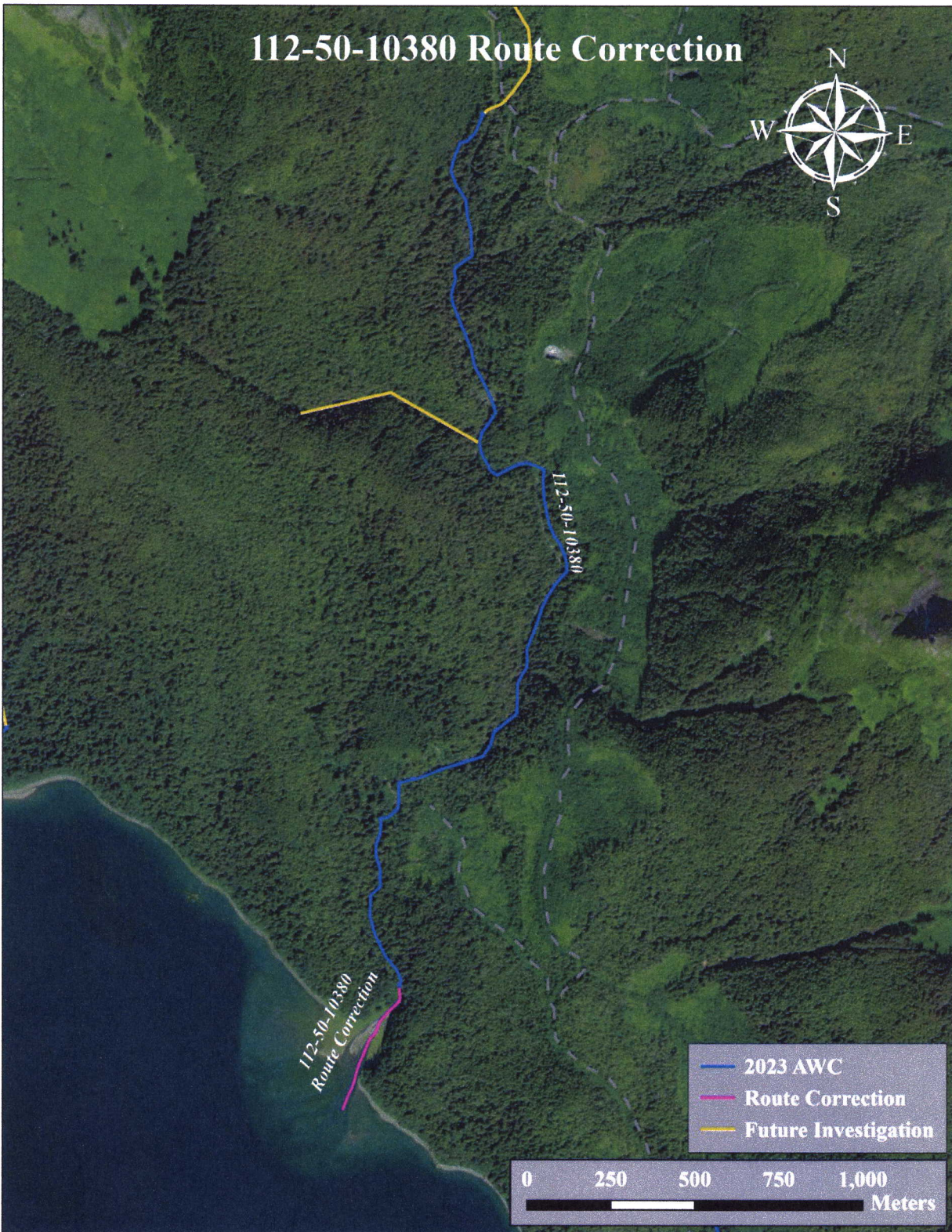
Figure 1.-112-50-10380 route correction map.