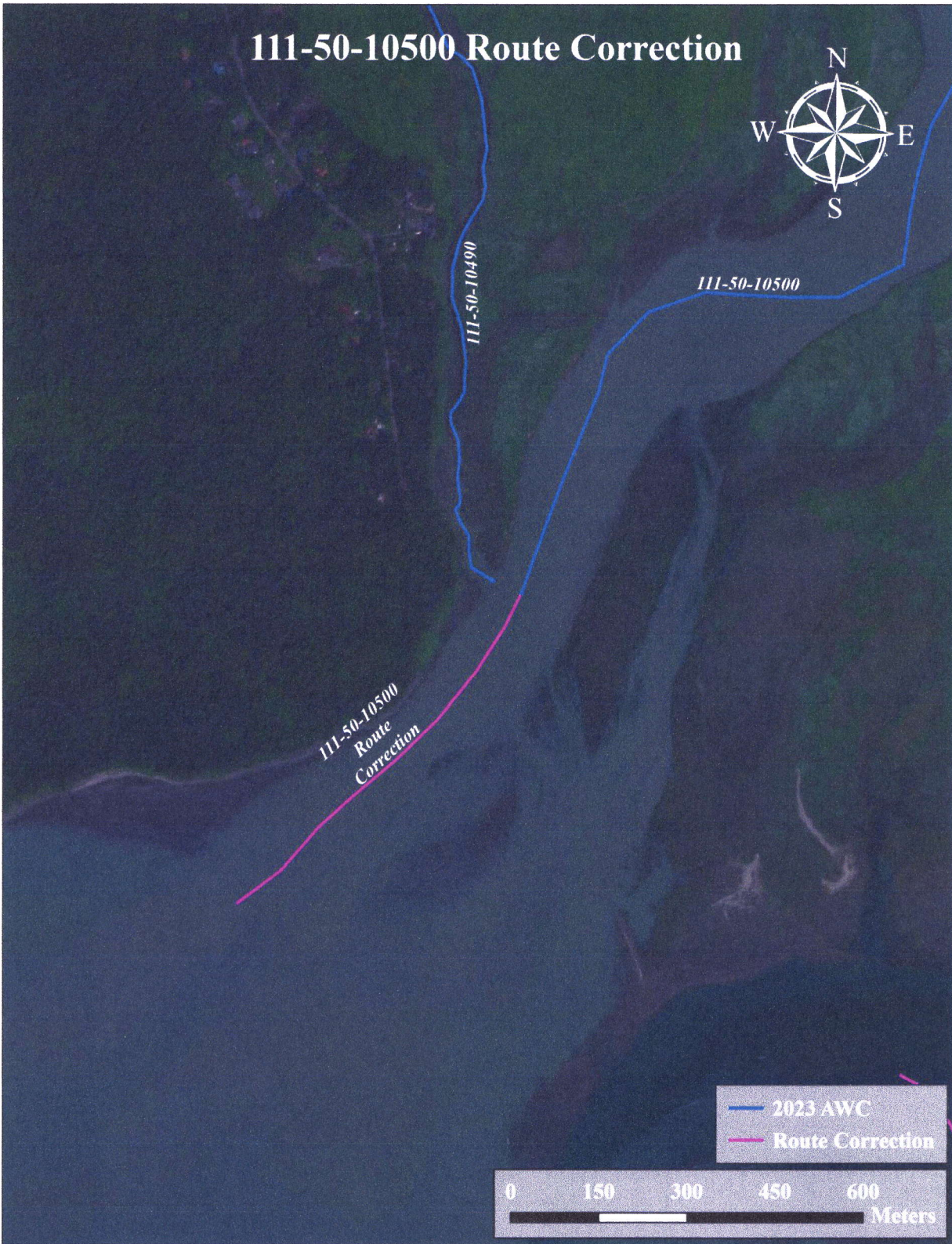
Figure 1.-111-50-10500 route correction map.