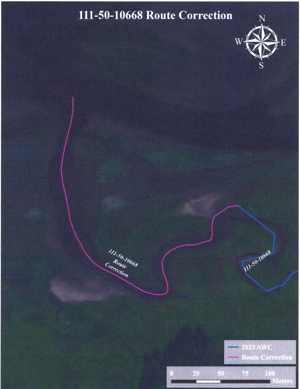
Figure 1.-111-50-10668 route correction map.