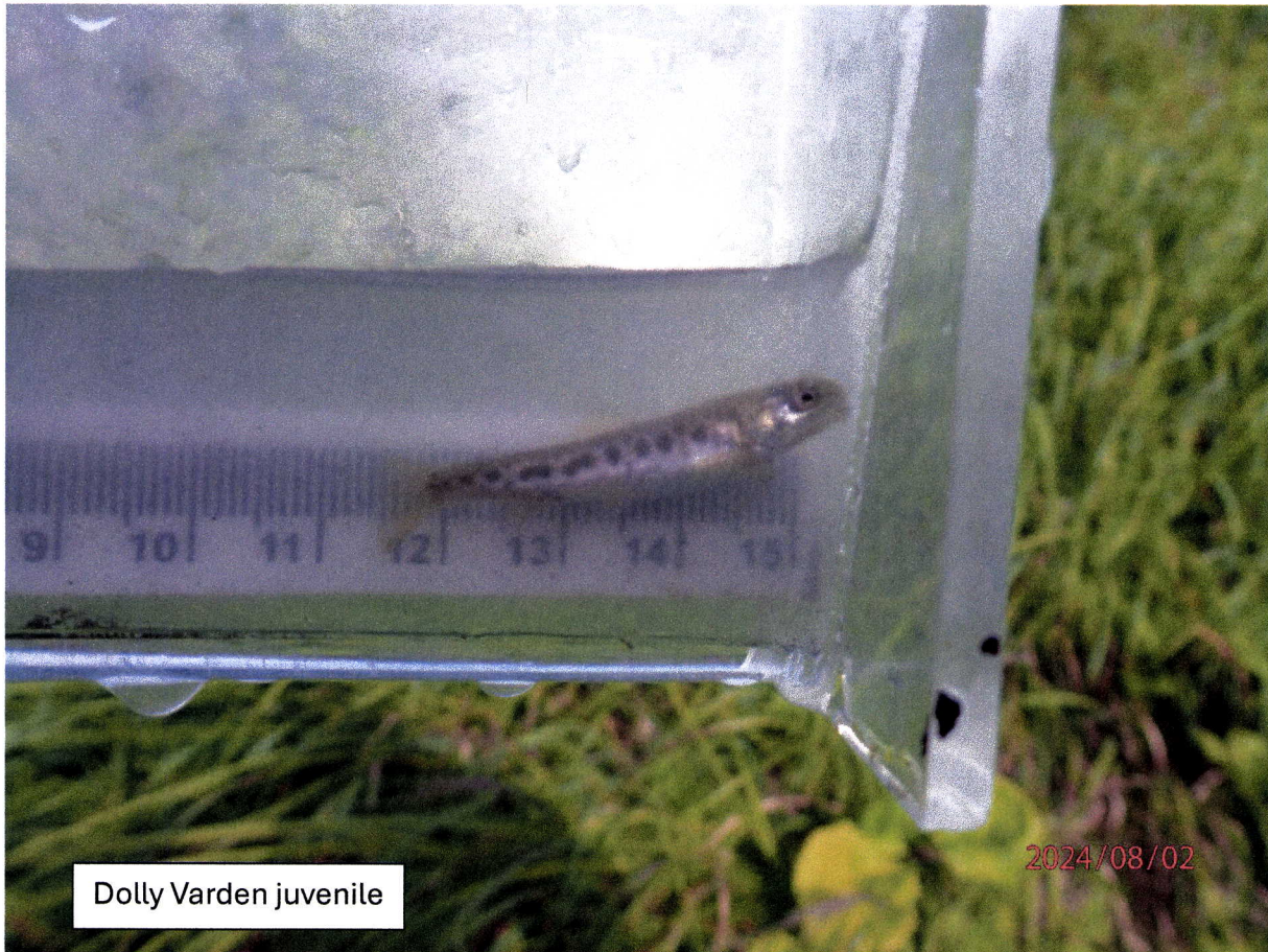
Dolly Varden juvenile