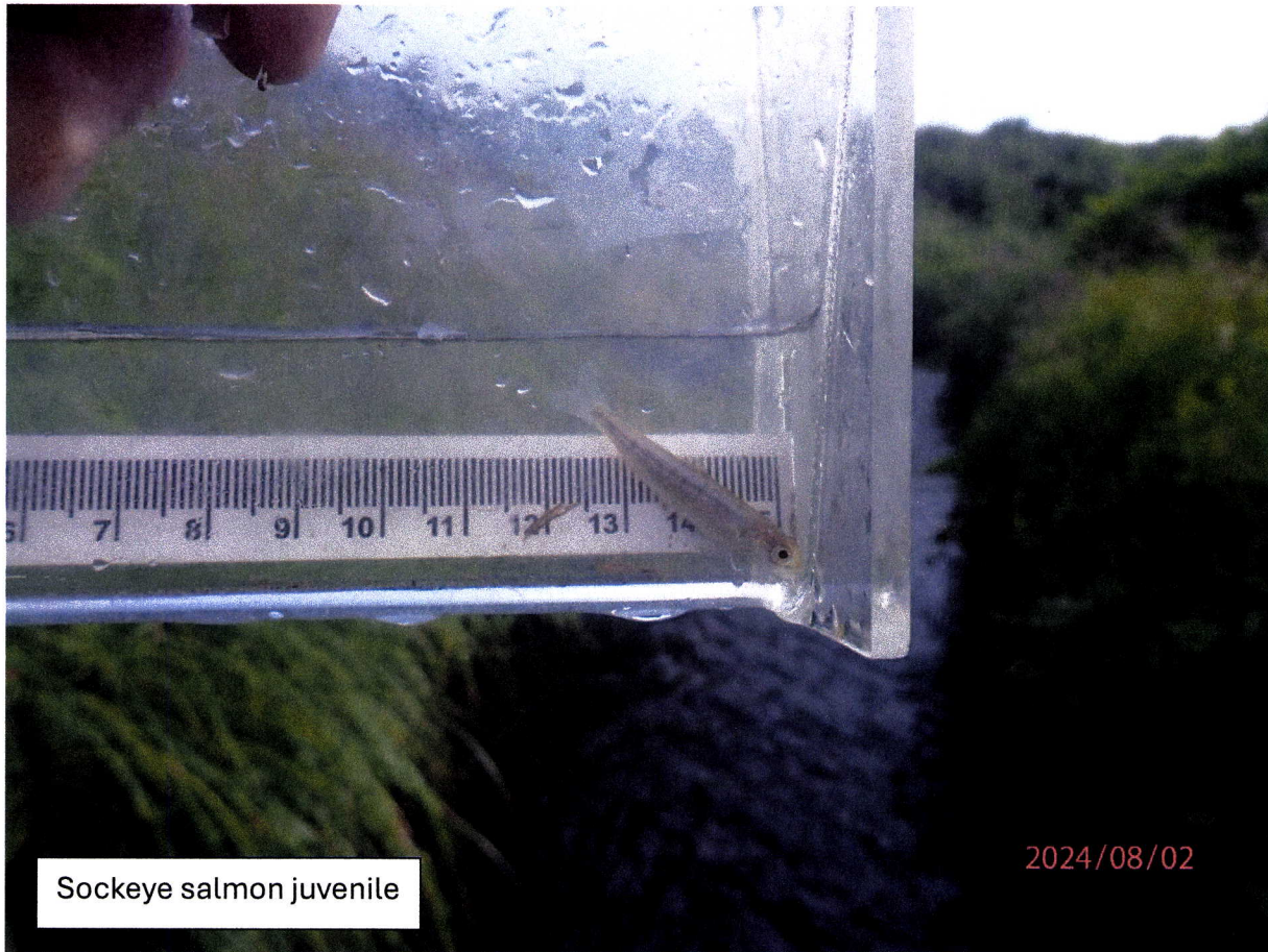
Sockeye salmon juvenile