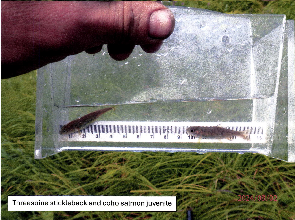
Threespine stickleback and coho salmon juvenile