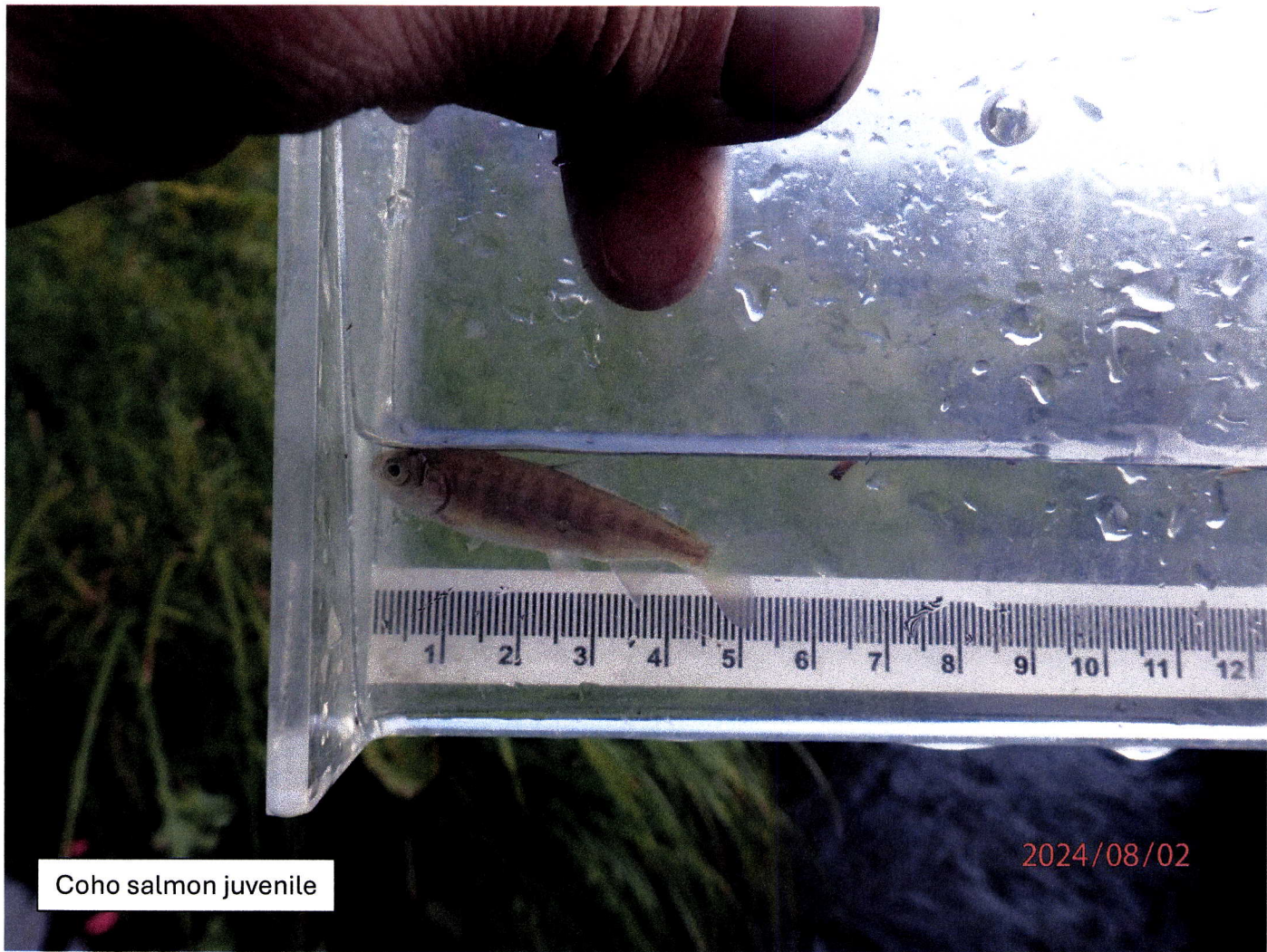
Coho salmon juvenile