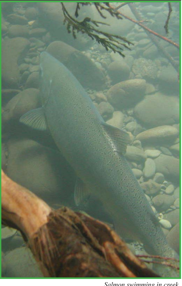
Salmon swimming in creek