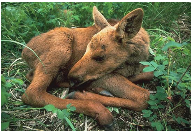
Moose calf