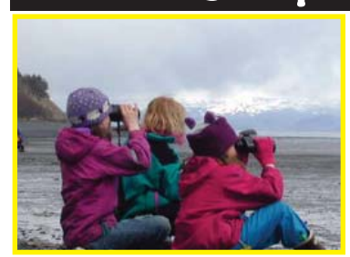
Homer Shorebird Festival birdwatchers

Photographers work with line, shape, texture, color and pattern.