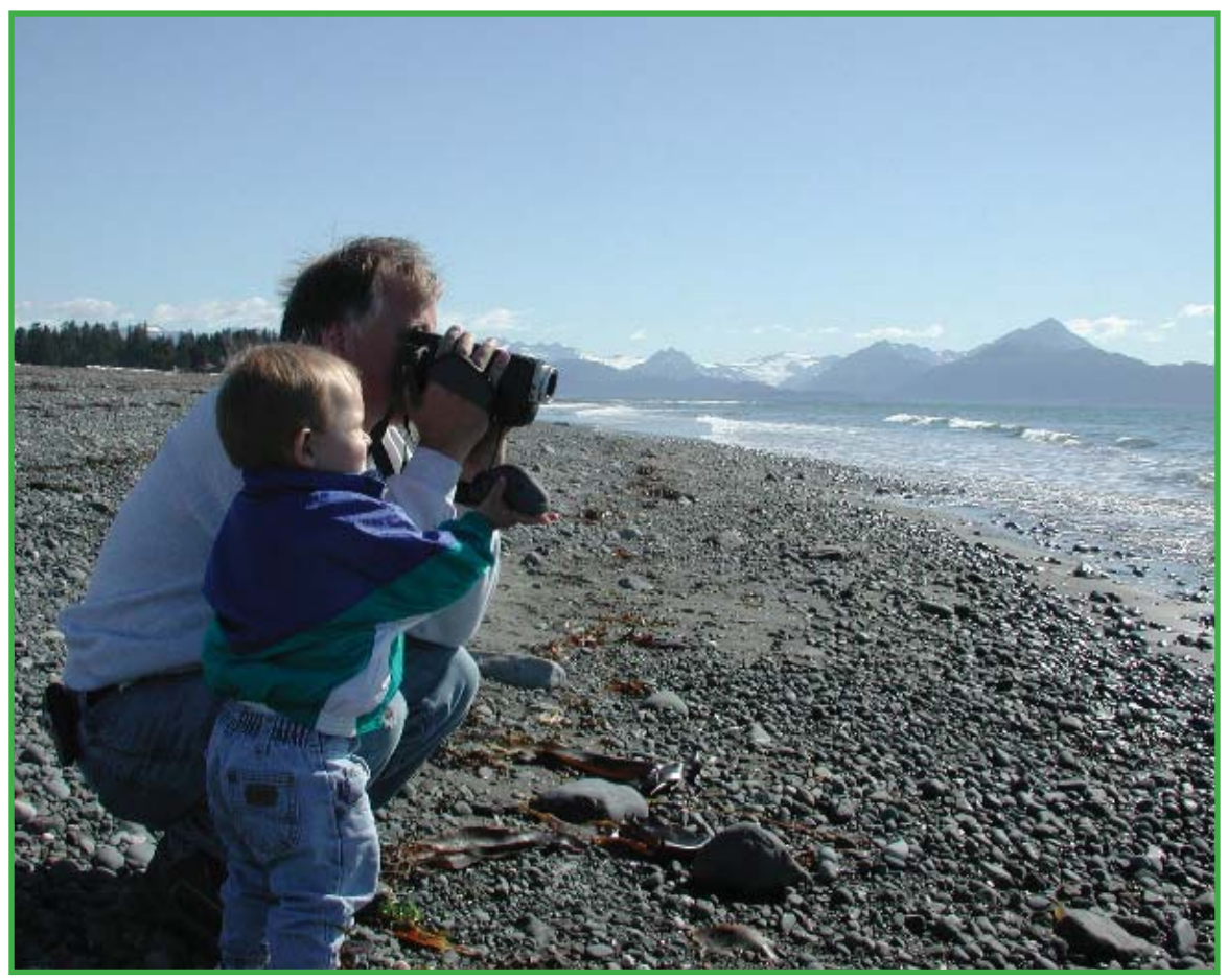
Bishop's Beach in Homer near the Alaska Maritime National Wildlife Refuge's Islands and Oceans Visitor's Center