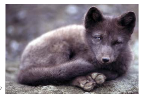
Fox kit