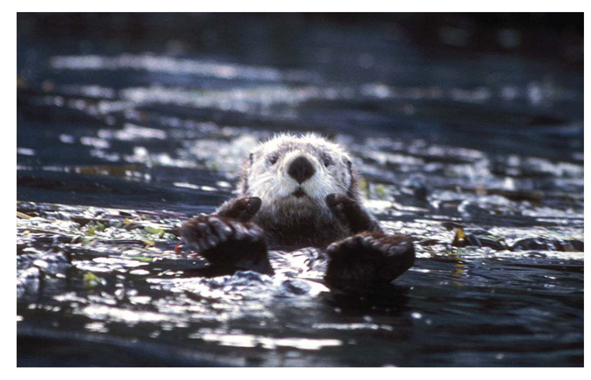
Sea Otter

One way is to ignore the animal completely. Focus your attention on the bottom or some other creature, and the animal may come close to investigate. Another trick I use is to pick up a rock, and repeatedly toss it up and catch it. Frequently a nearby sea mammal will come in and investigate.