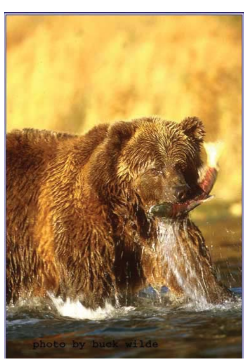
Brown Bear with Salmon