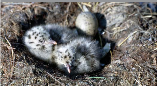
Glaucous-winged gull in nest.