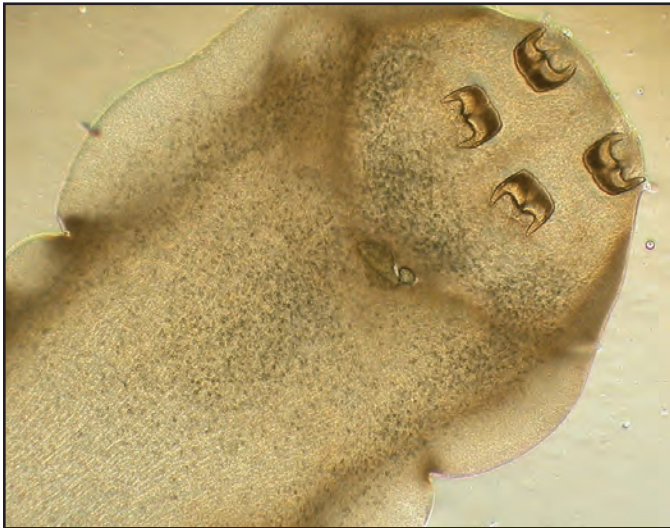
Characteristic trident shaped hooks on scolex of Trienophorus crassus plerocercoid found in fish muscle, X 40.