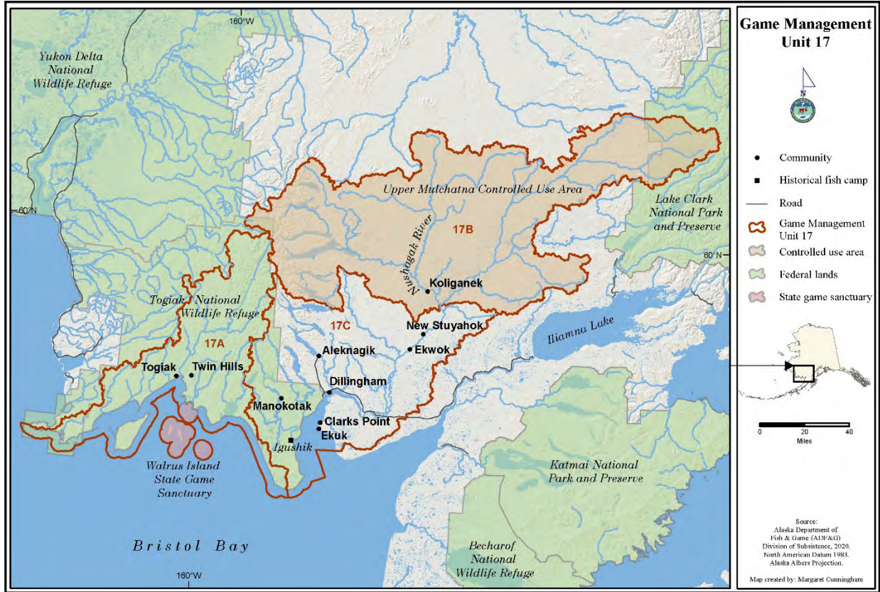
Figure 1.—Game Management Unit 17.