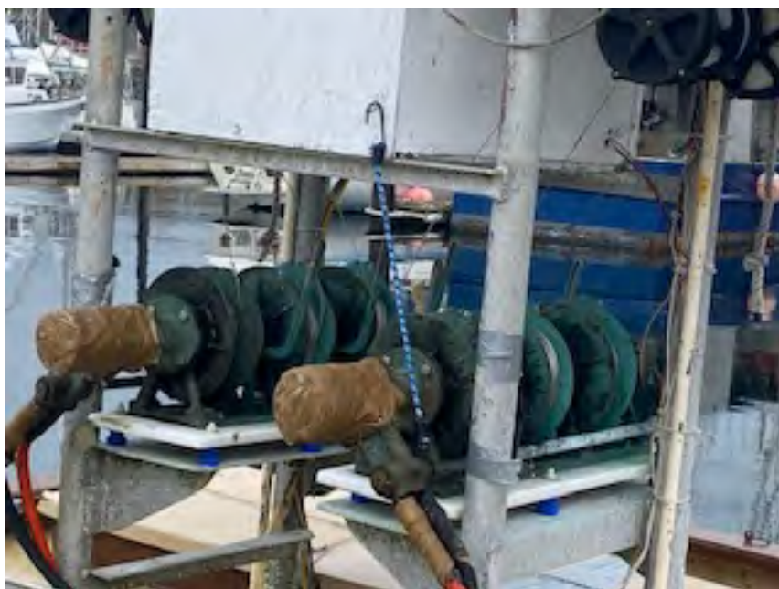
A 35ft troll vessel with 3 spool gurdies: