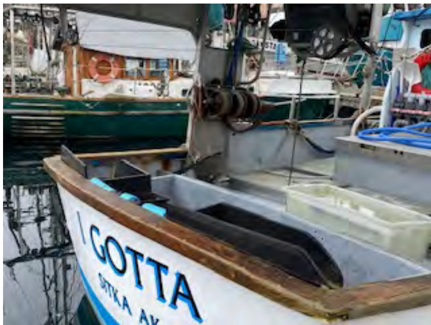
Another smaller vessel with 3 spool gurdies: