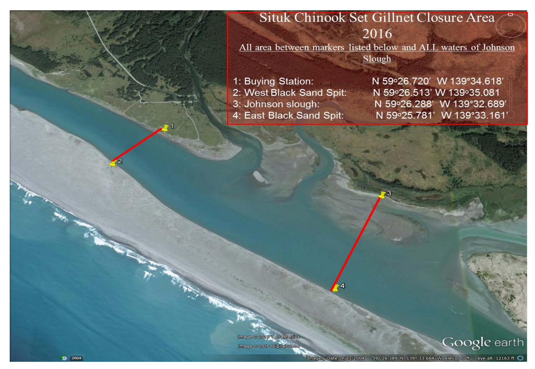
Figure 2.–Situk-Ahrnklin Inlet commercial set gillnet fishery closure area in 2016.