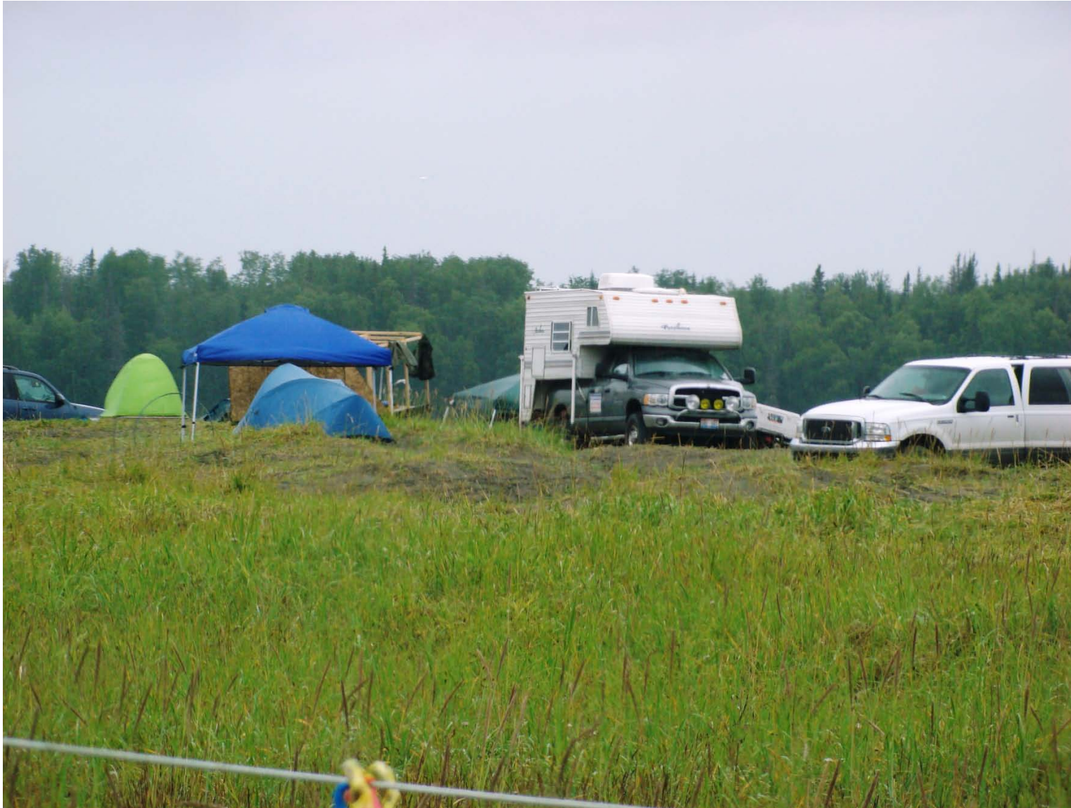
Photo #59 – Tents, Vehicles on Sensitive Grasslands - Kasilof River