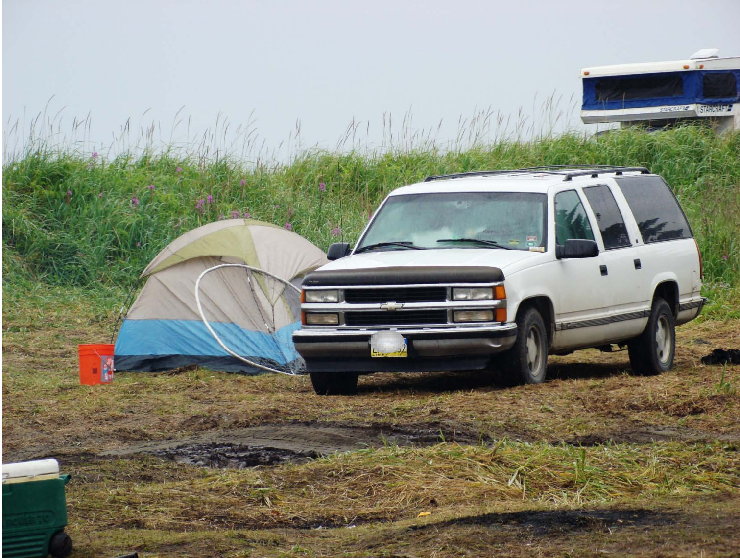
Photo #58 - Illegal Camping on Sensitive Grasslands - Kasilof River