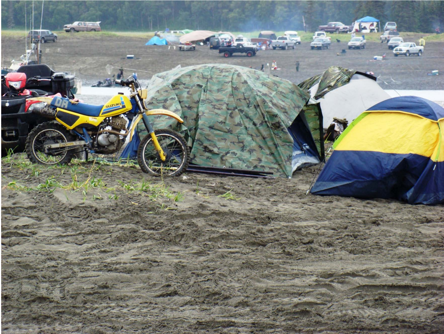
Photo #60 – Tenting, Dirt Biking on Sensitive Grasslands - Kasilof River