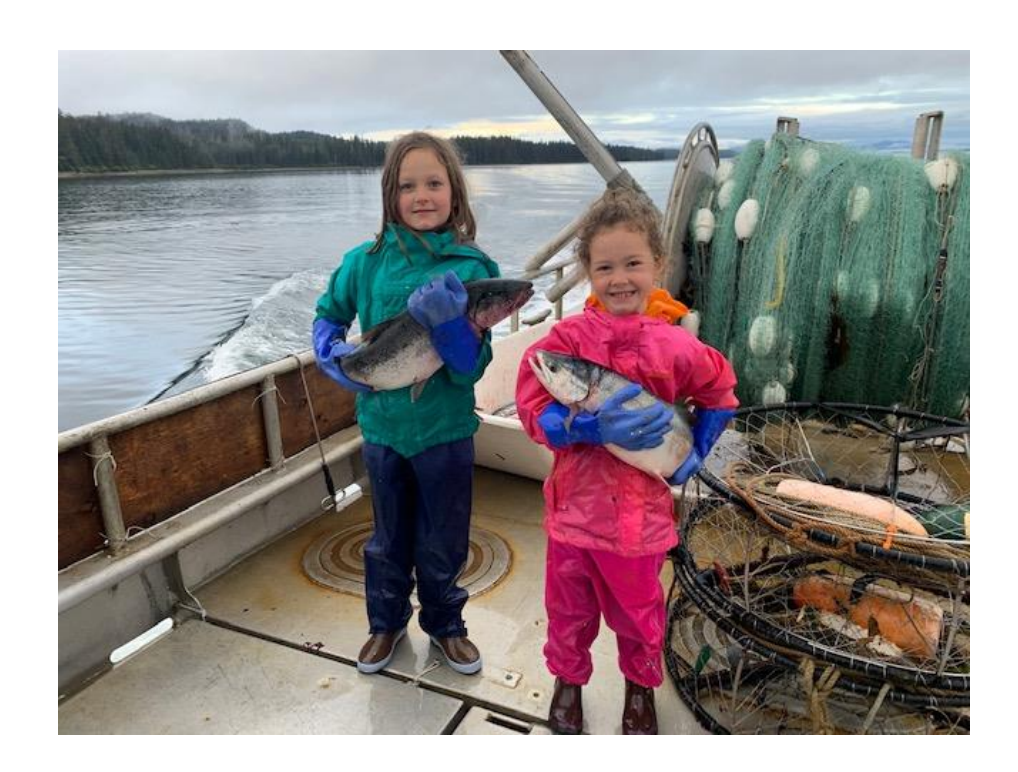
2022–2025 Southeast Alaska and Yakutat Commercial Salmon Fishing Regulations