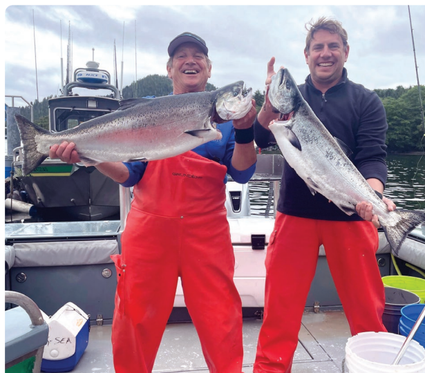
A great day of fishing!