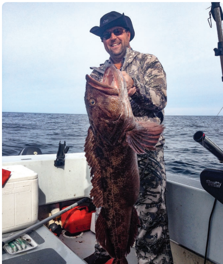
Lingcod caught in SE waters.