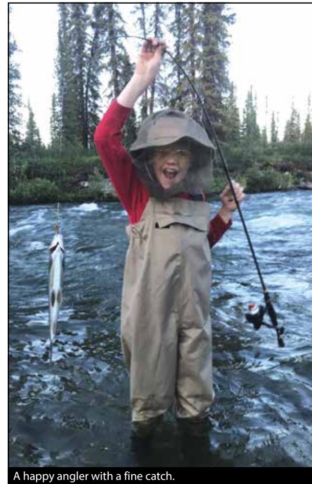
A happy angler with a fine catch.