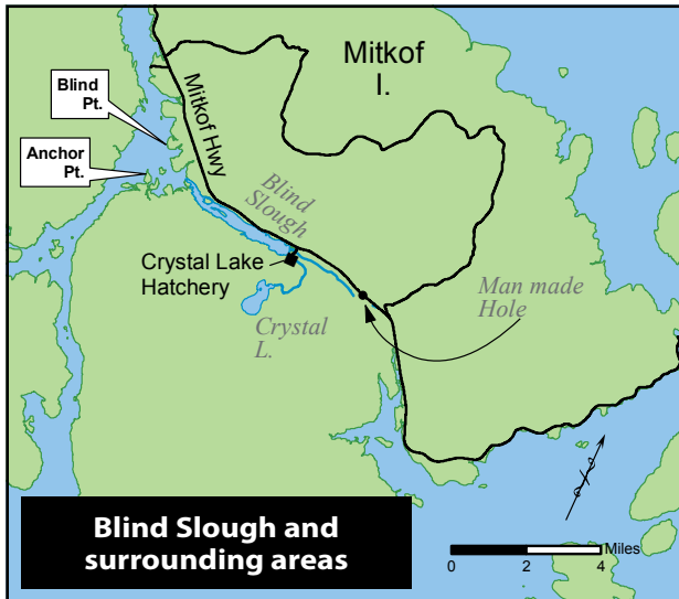
Blind Slough and surrounding areas