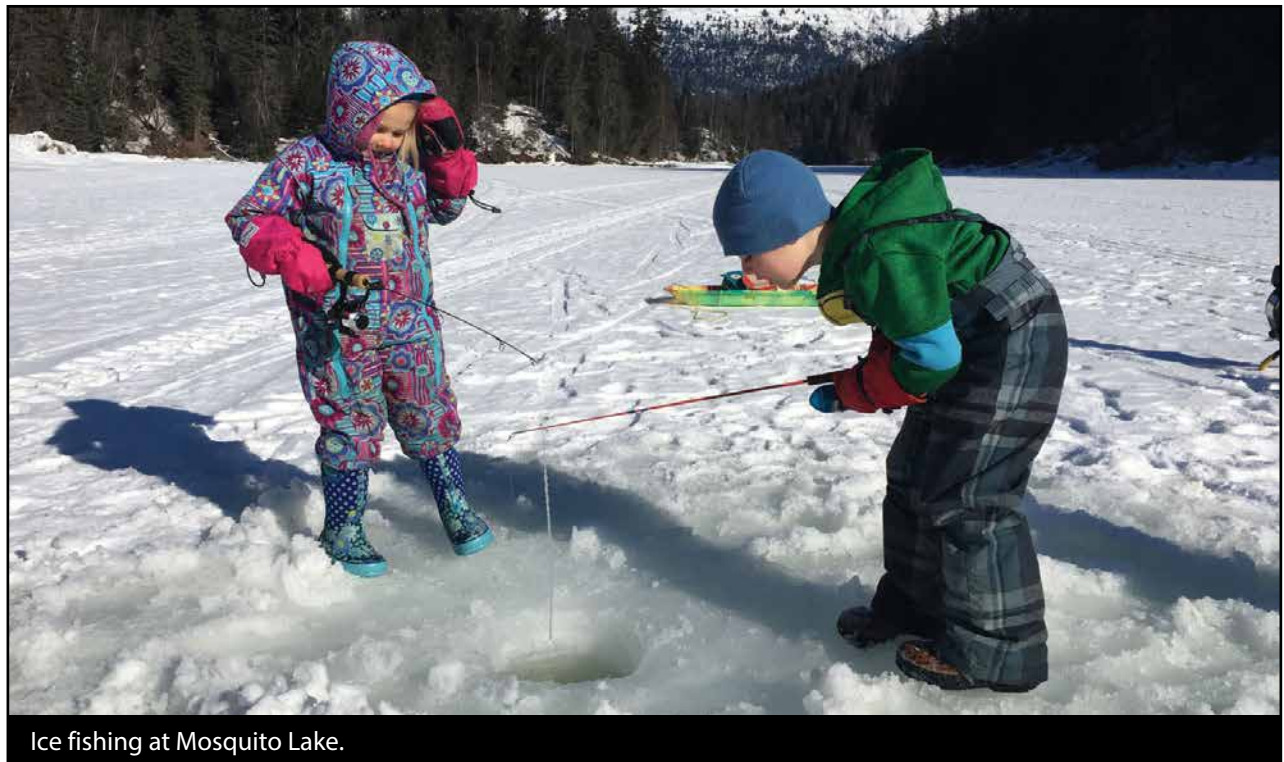
Ice fishing at Mosquito Lake.

Get the latest fishing info emailed to you.