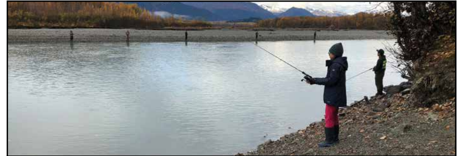
Anglers at the Chilkat River.