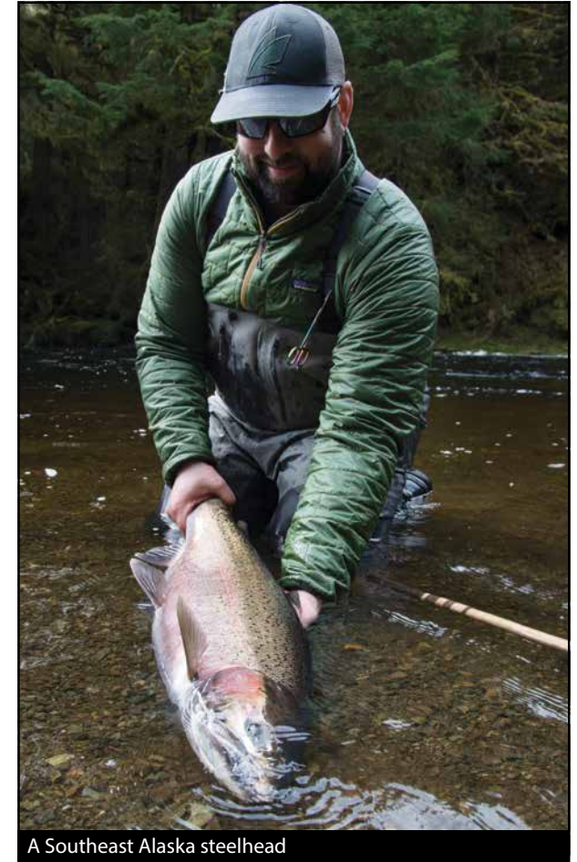
A Southeast Alaska steelhead