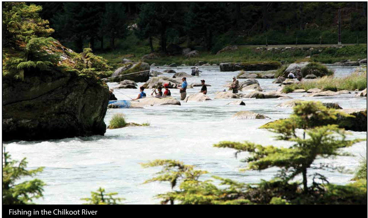
Fishing in the Chilkoot River