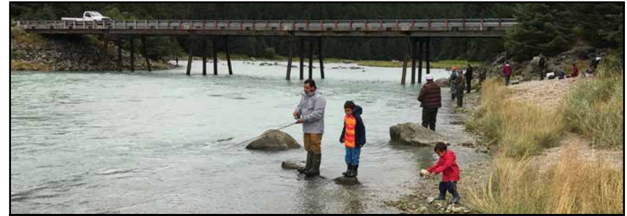
Anglers fish for pink salmon near the Chilkoot Bridge