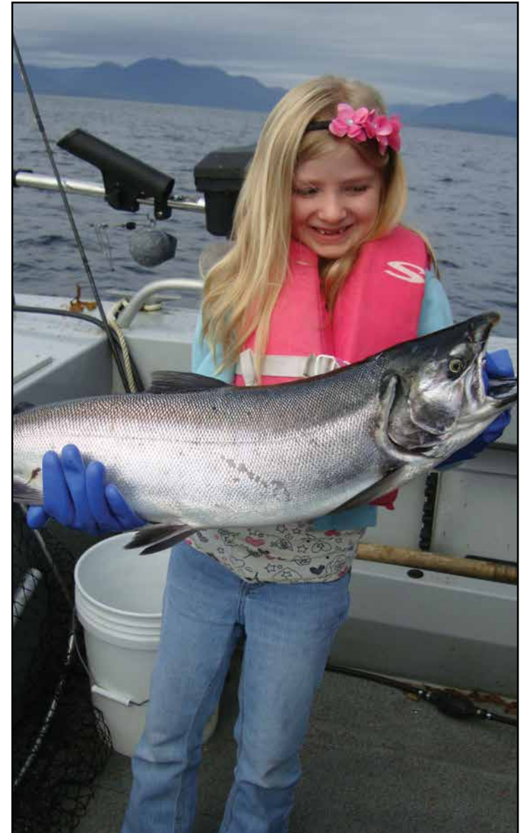
An ocean-bright coho salmon