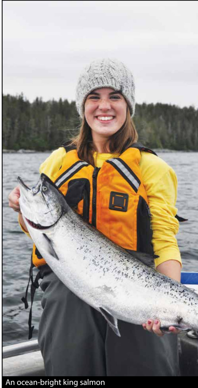
An ocean-bright king salmon