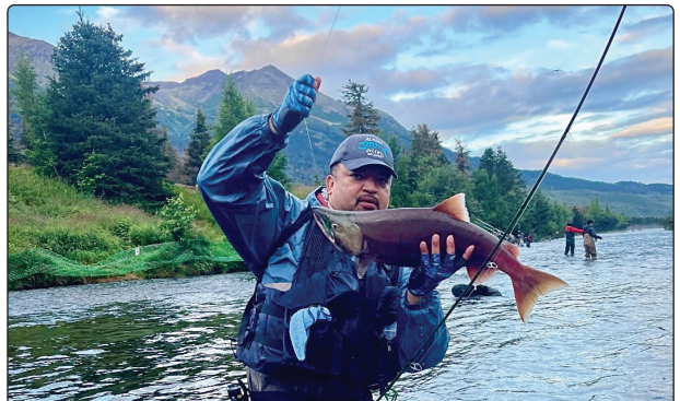
Hooked on fishing.

Nonresident Military Annual Sport Fishing License ..... $20 Only for active duty military service members permanently stationed in Alaska for less than 12 months or for their dependent(s).