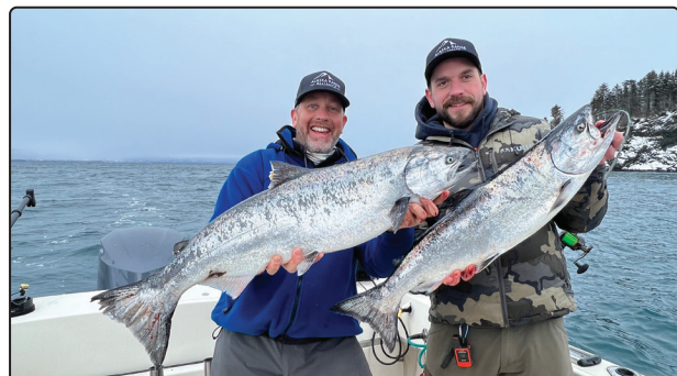
Winter chrome Chinook salmon from Homer.