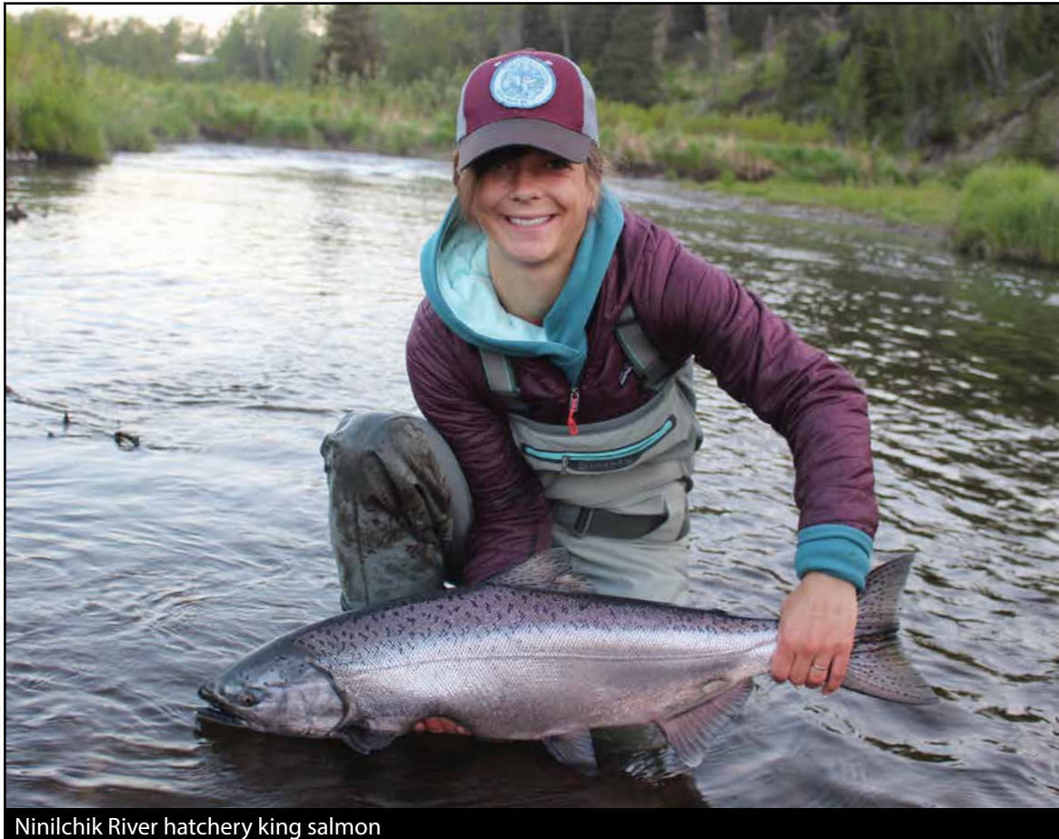
Ninilchik River hatchery king salmon